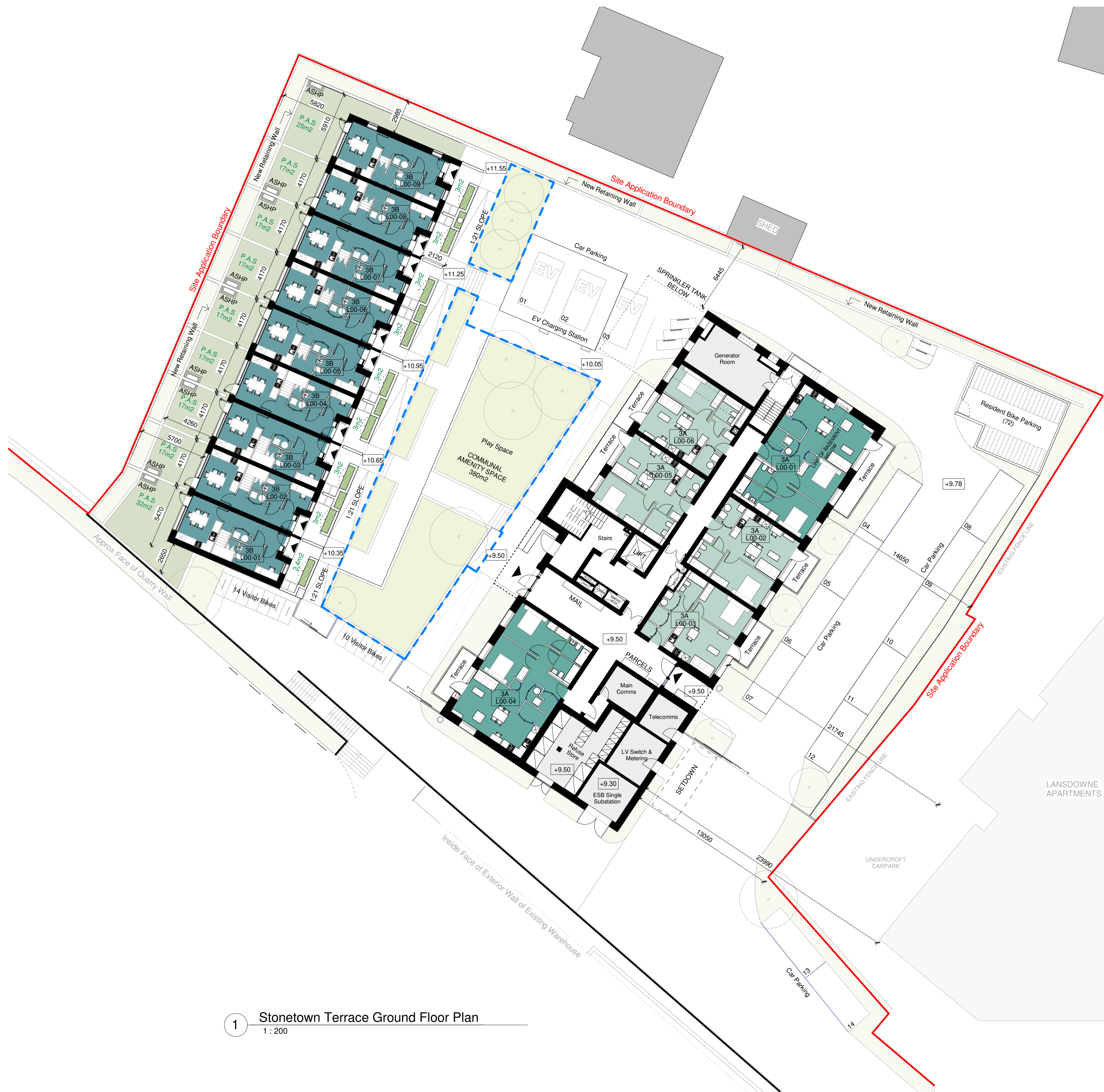
1 Stonetown Terrace Ground Floor Plan 1 : 200