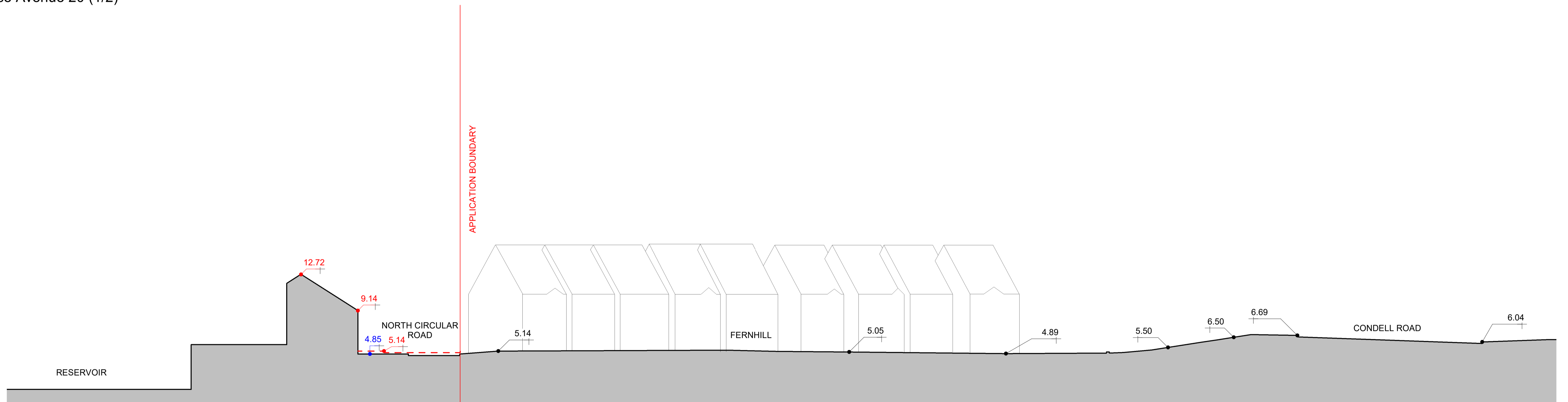
Proposed Site Section Clanmaurice Avenue 20 (2/2)

NOTES: Dimensions are not to be scaled from this drawing. Drawing only to be used for the purposes it was issued for. Landscape, public realm and neighbouring buildings shown indicatively. Existing site building plans and elevations are based on survey information drawings received on 11.09.2020. GEOData 1A-Measured Buildings Survey (Blocks 1-14) Existing levels are noted from topographic survey information received on 25.10.2024. GEOData 7A-18885-200-06 3D. Except where noted. Additional site and building section drawing information interpreted from BlueSky model received in 2025. Model has an accuracy of up to +/-50cm RMSE (Root Mean Square Error)