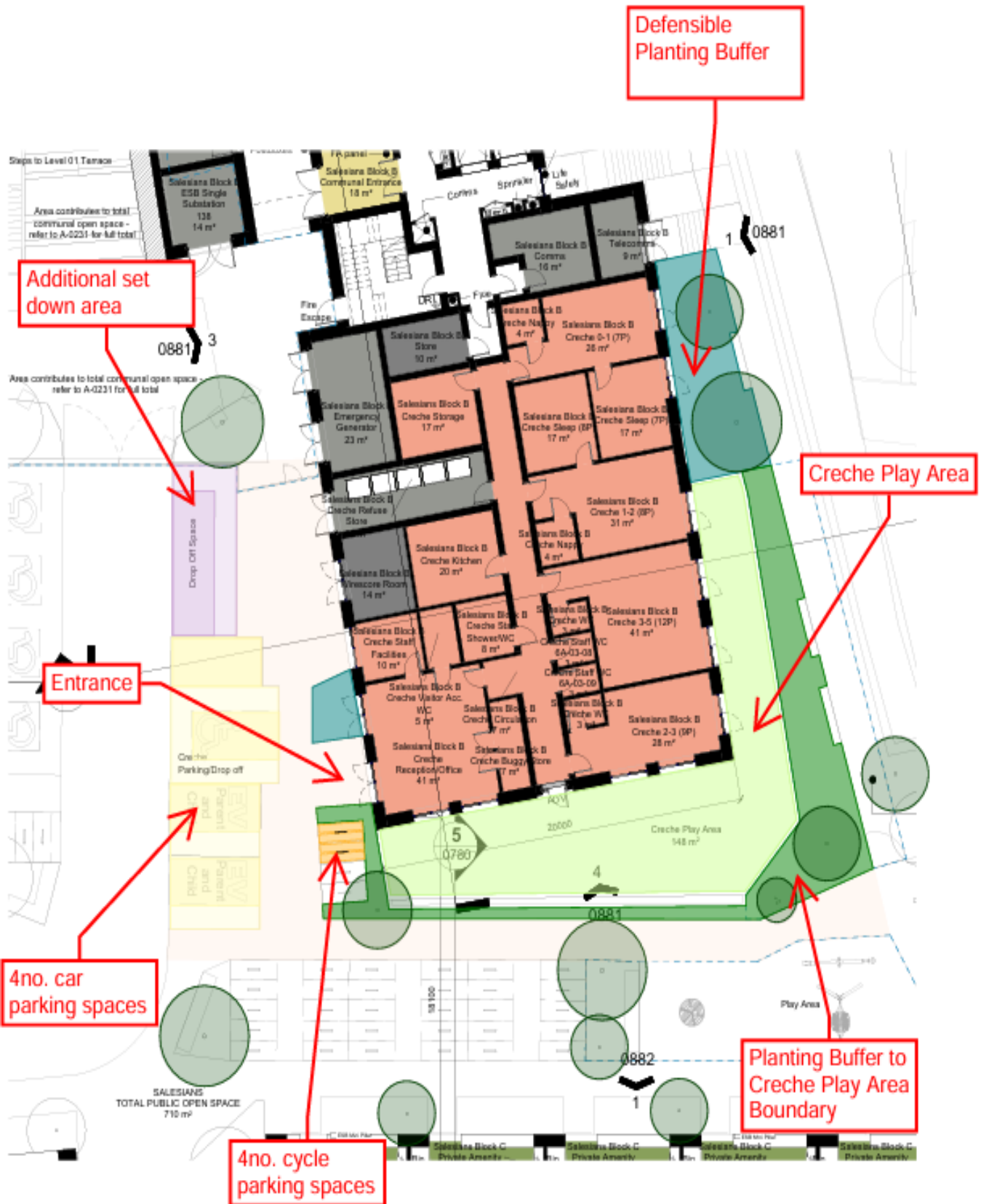
Figure 1.0 Layout of Proposed Creche