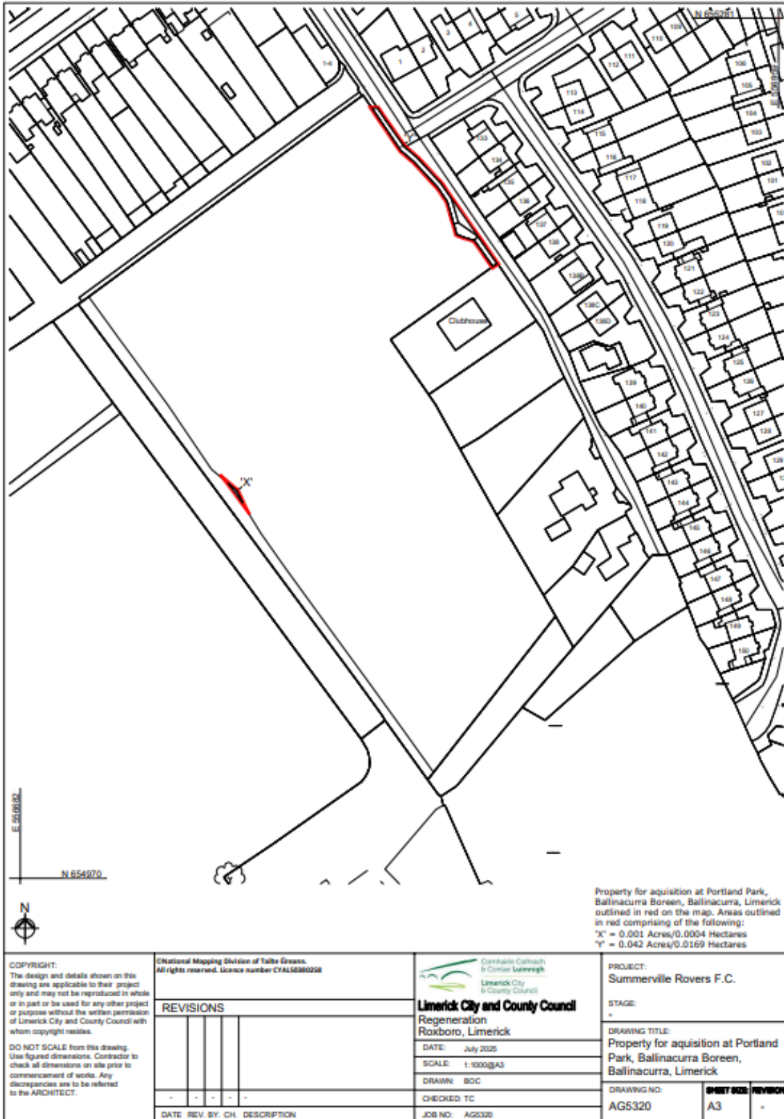
Location Map – property marked in red