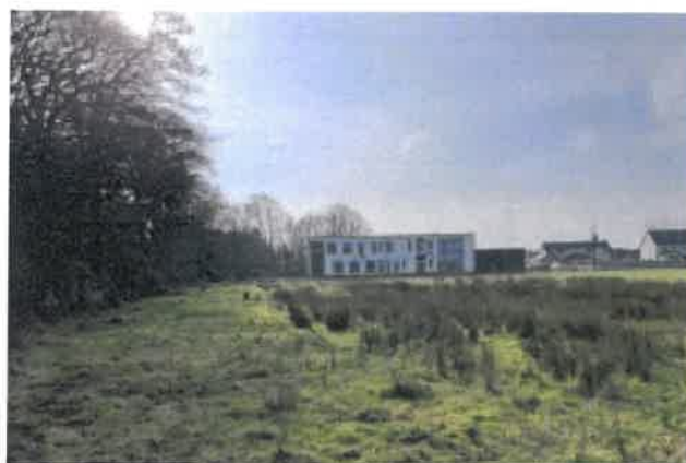
Subject Land Facing Croom PCC