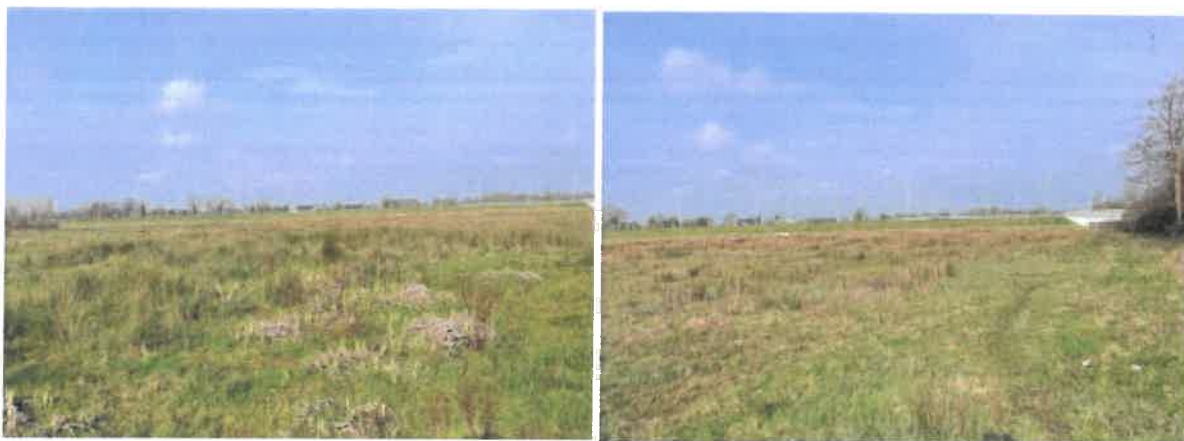
General View of the Land Facing Northern Boundary