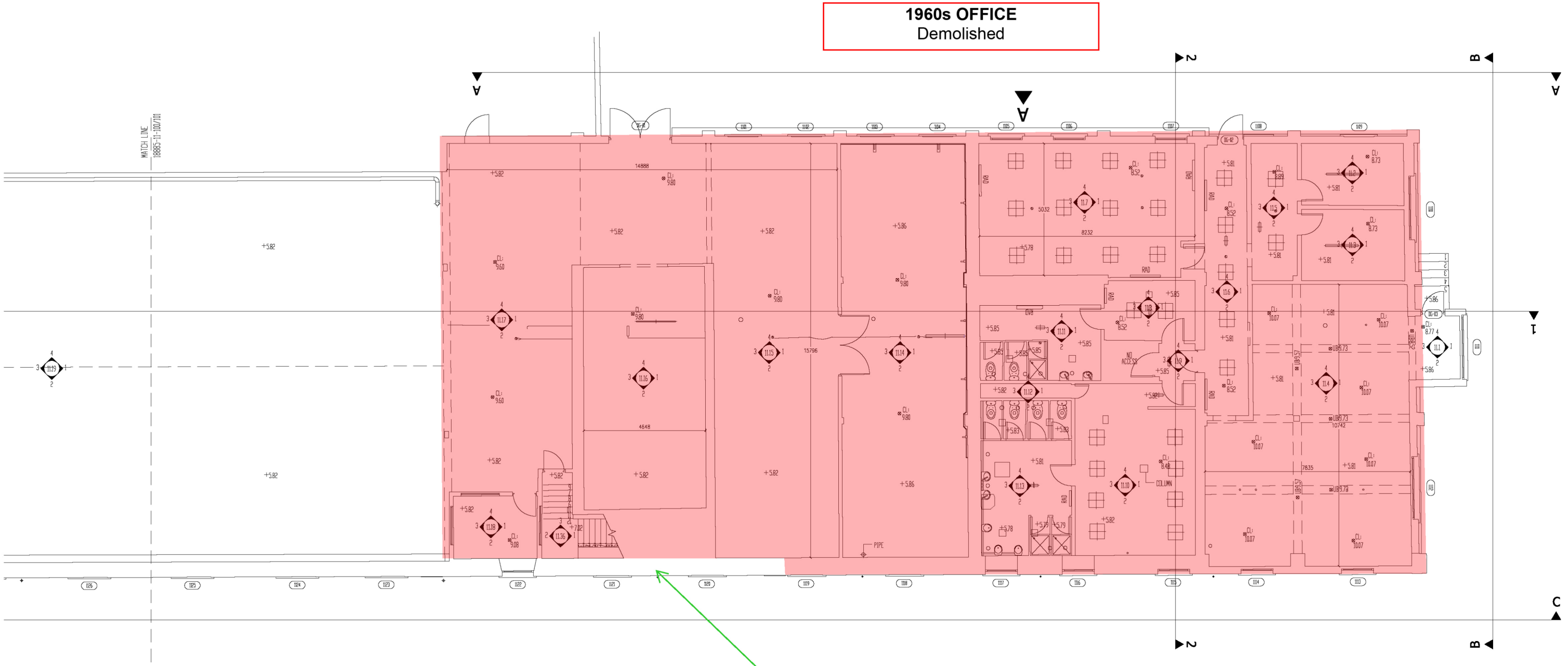
Ground Floor Plan Scale 1:150