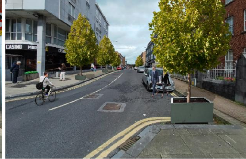
Glentworth St. Upper – After Project