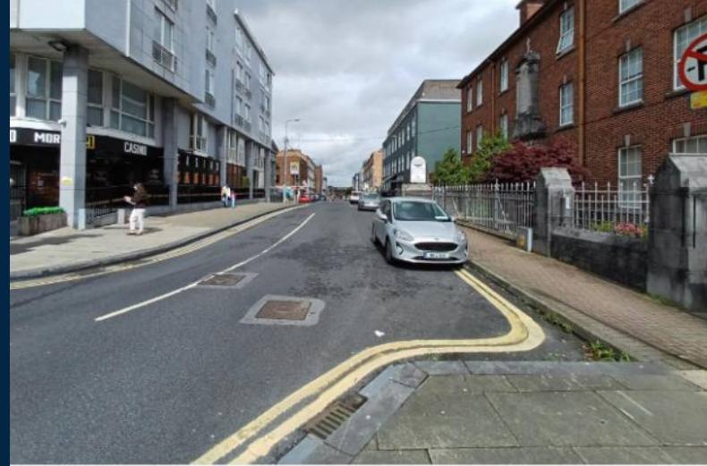
Glentworth St. Upper – Before Project