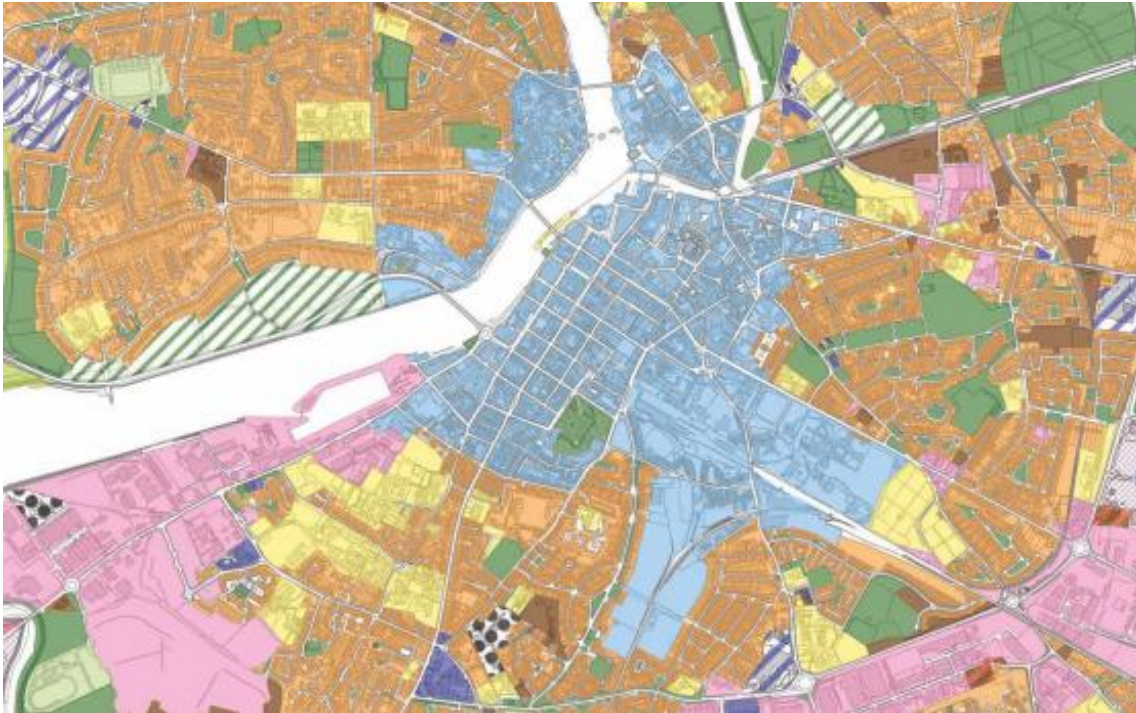
Figure 1: Limerick Development Plan 2022-2028 with 'city centre' zoning defined in light blue.