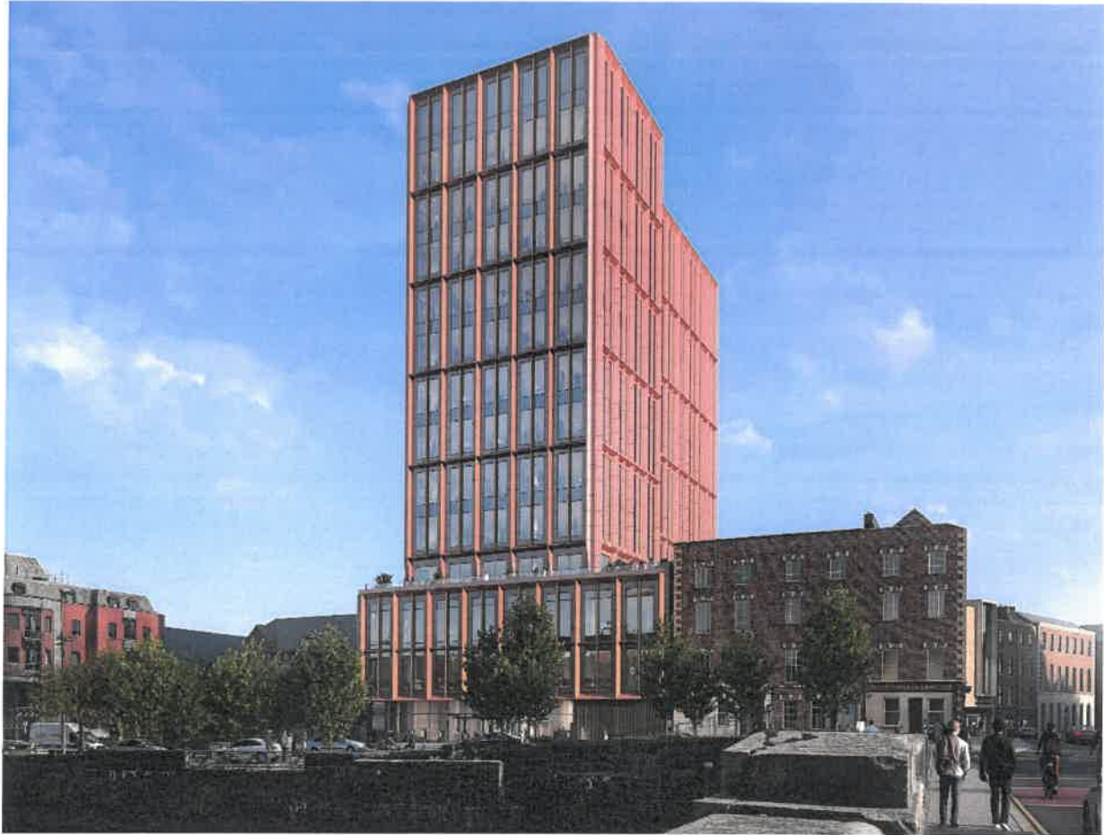
Fig 1. Image of the proposed 14 Storey Office Block.