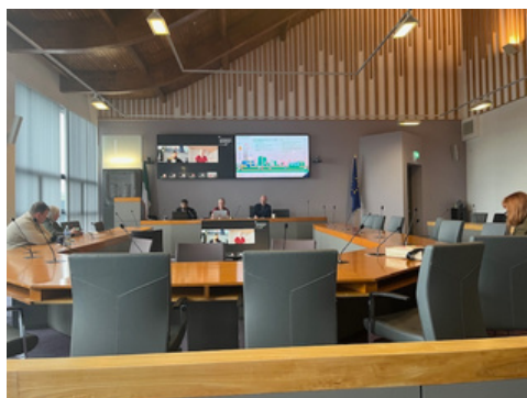
Photo of the in-person workshop