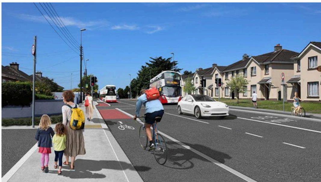
Photo montage of TUS Moylish to Limerick City Centre Active Travel Scheme

The works will include footpath upgrades and segregated cycle lanes along the Cratloe Road, Sexton Street North and High Road , along with a number of dedicated crossing facilities, intended to improve safety for all road users.