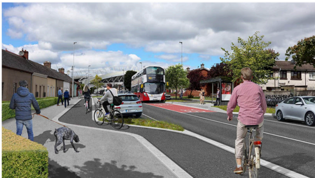
Photo montage of TUS Moylish to Limerick City Centre Active Travel Scheme