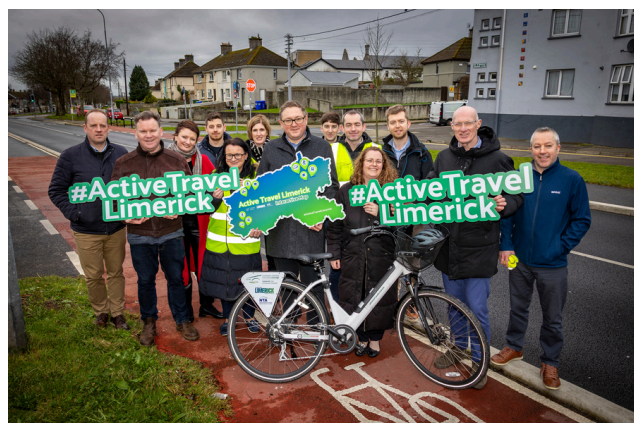
Members of the Active Travel Limerick Team

The intent is to share the map's information with OpenStreetMap and Google Maps, in order for members of the public to be able to use existing tools for accurate cycle and pedestrian journey planning.