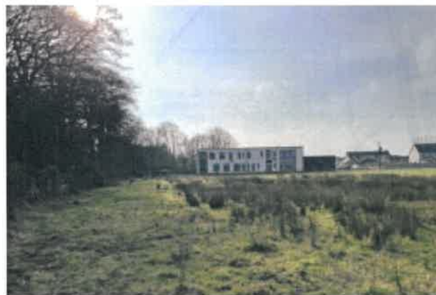
Subject Land Facing Croom PCC