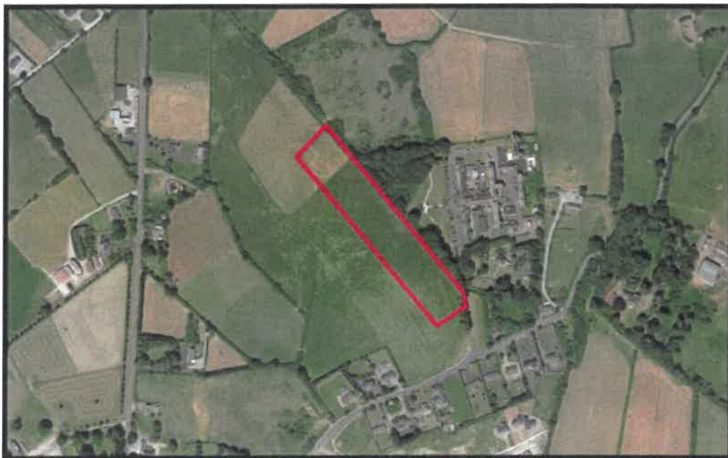
Site Boundary Highlighted in Red (Indicative Outline Only)

Proposed Disposal of 2.72 acres (1.1 ha) of Land at Skagh, Croom, Co. Limerick to the Health Service Executive.