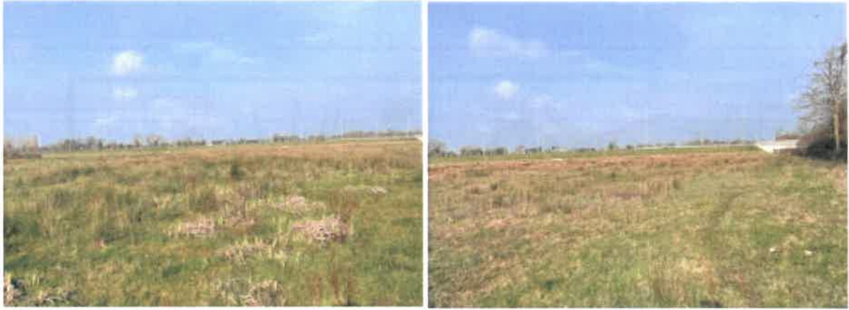
General View of the Land Facing Northern Boundary