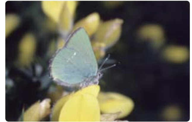
Green Hairstreak (Ian Rippey)