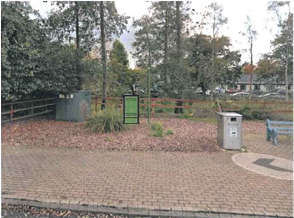
Photo of Proposed DRI Site at Main Street