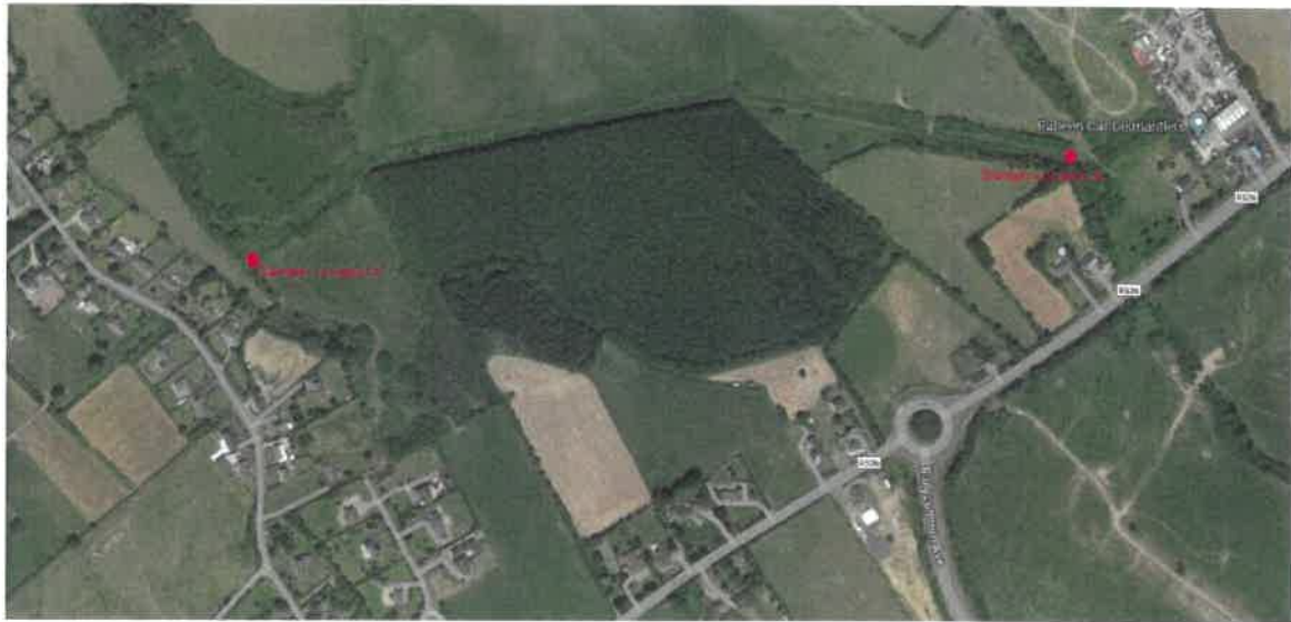
Figure 1 – Sample Locations 2023

In February 2023, Limerick City and County Council procured a laboratory, BHP, to undertake a sampling programme at two locations in the canal, the outfall (A) and downstream (B), on a monthly basis as shown below in Figure 1. This programme commenced in March 2023.