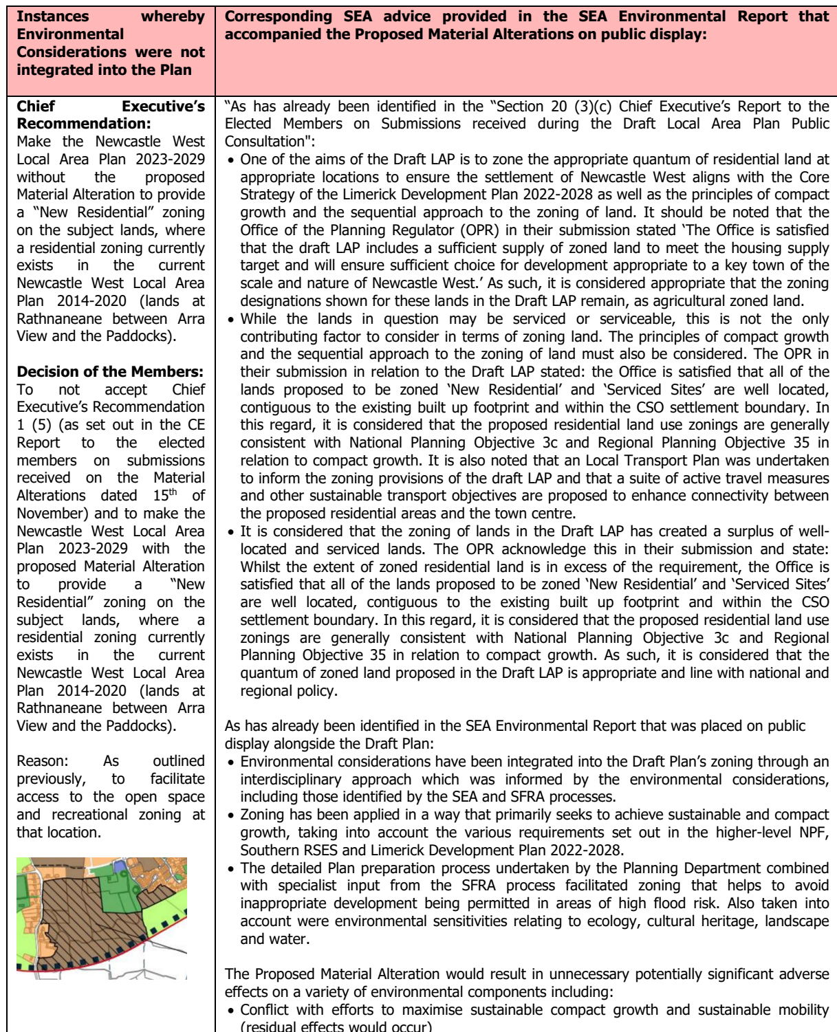
Table 5.2 Instances whereby Environmental Considerations were not integrated into the Plan and corresponding SEA/AA/SFRA advice

Table 5.2 describes instances whereby environmental considerations were not integrated into the Plan by the Elected Members and the corresponding environmental advice that was provided at the time through the SEA/AA/SFRA processes.