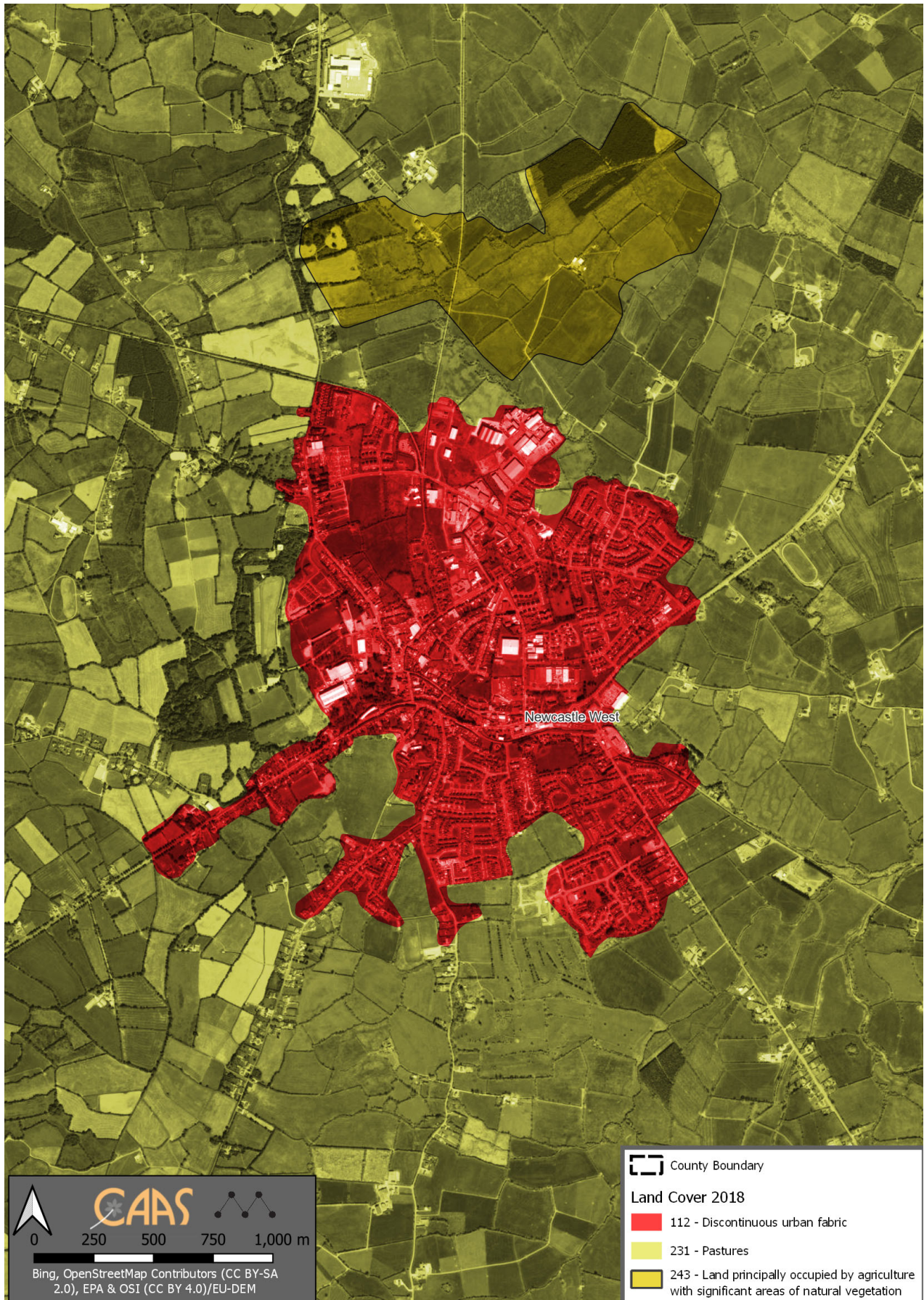
Figure 3.2 CORINE Land Cover Mapping 2018