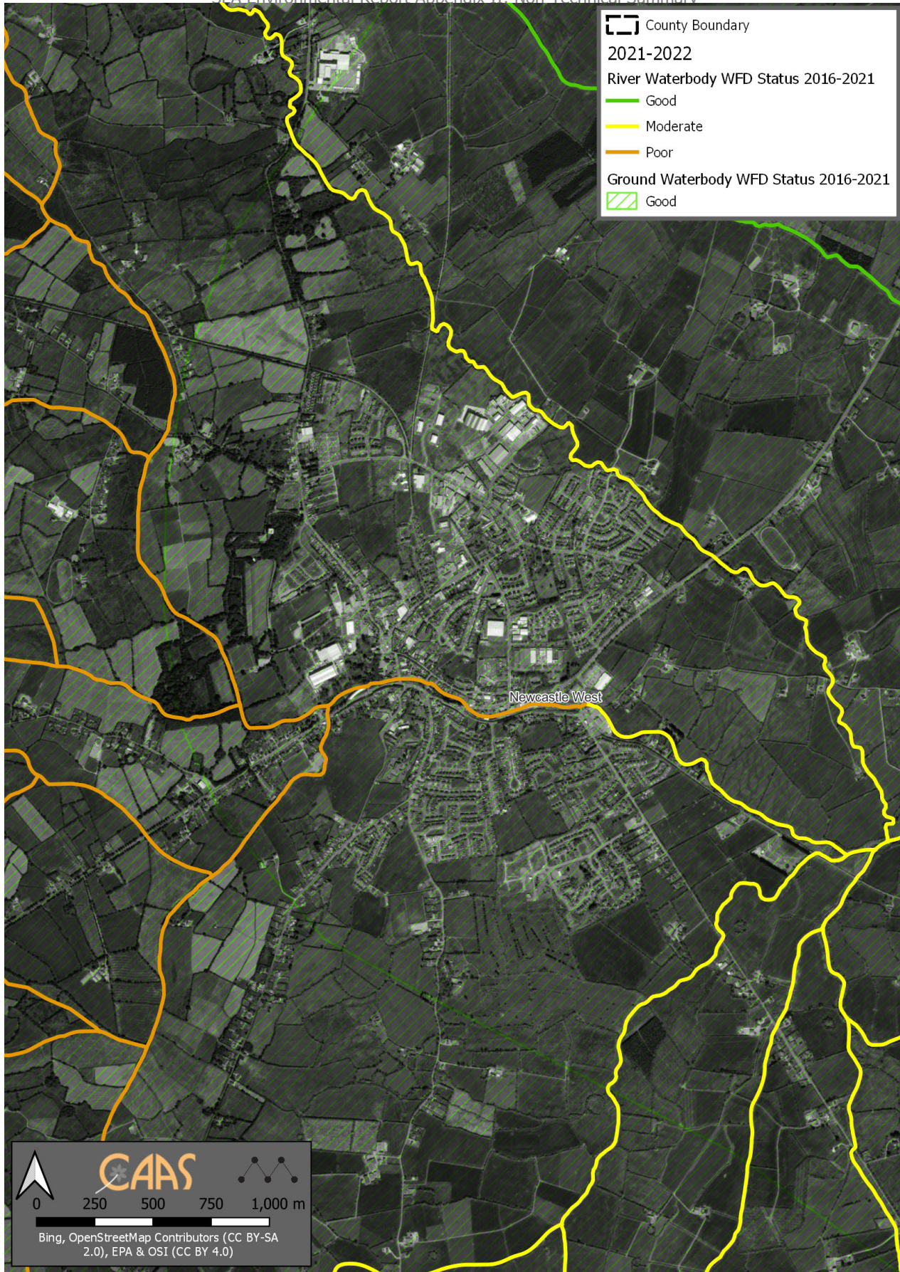
Figure 3.3 Surface Water Status (2016-2021)