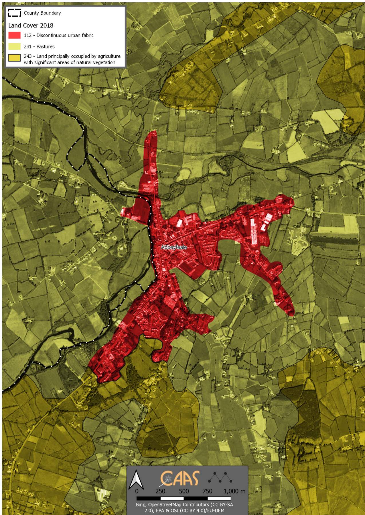
Figure 3.2 CORINE Land Cover Mapping 2018