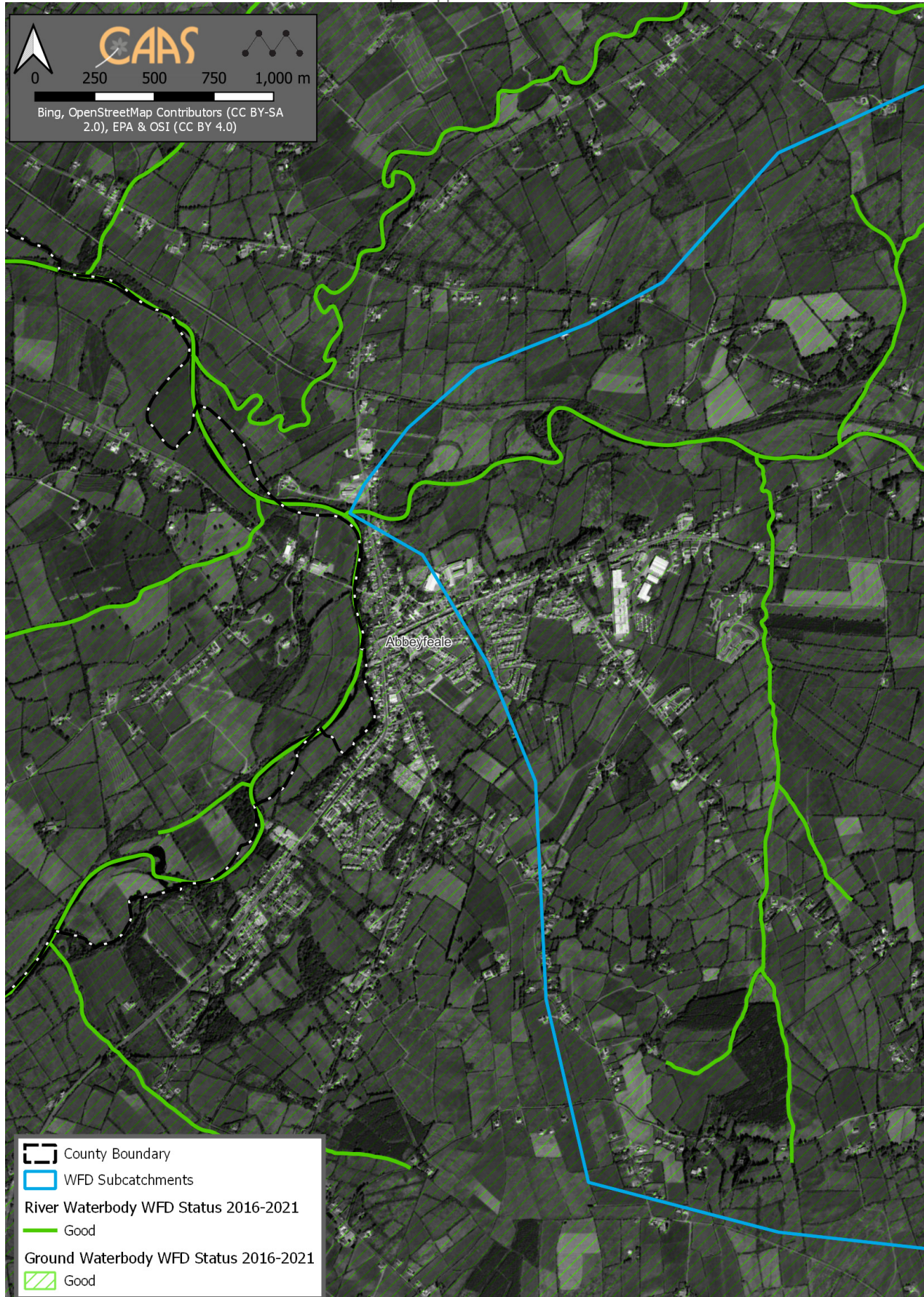
Figure 3.3 Surface Water Status (2016-2021)