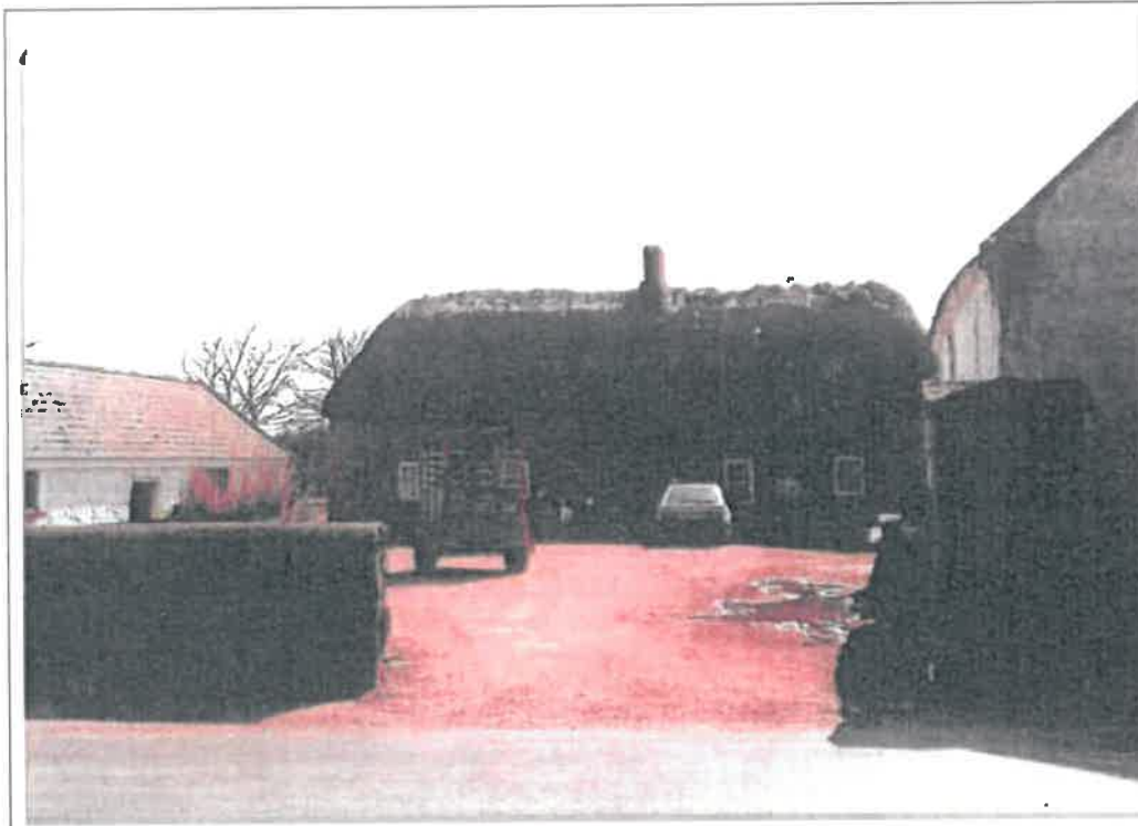
Fig. A2: Record photograph of the 'Fitzgerald's' Thatched House, dating from mid-1990's.