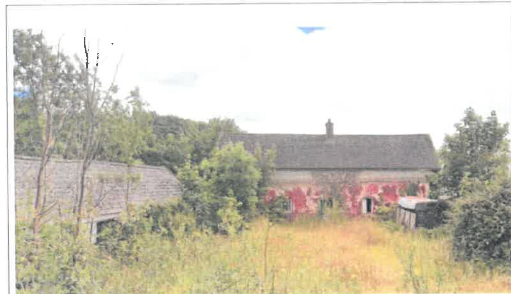
Fig. A3: Current condition of 'Fitzgerald's' Thatched House at Gortnascarry, Cappamore.