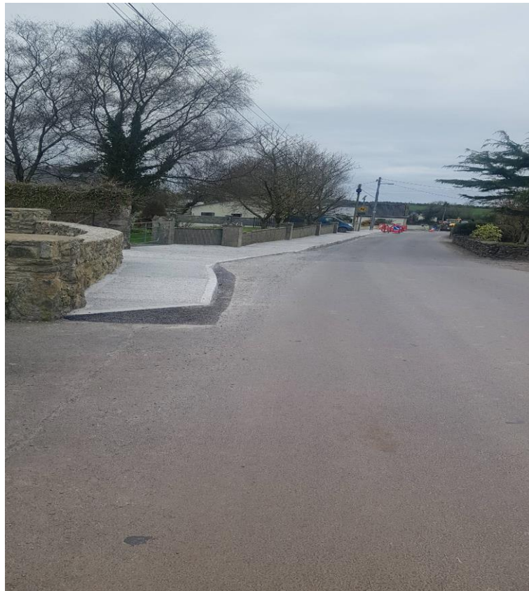
Active Travel, Ballysteen