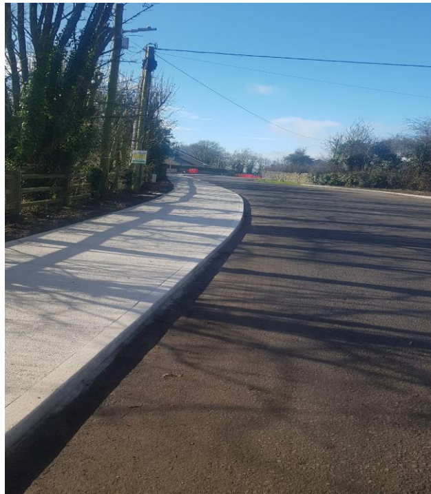
Active Travel, Ballycullen Road Askeaton