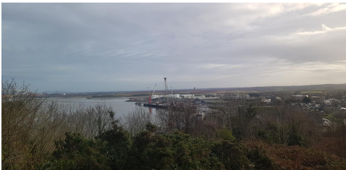
Monument Hill View, Foynes