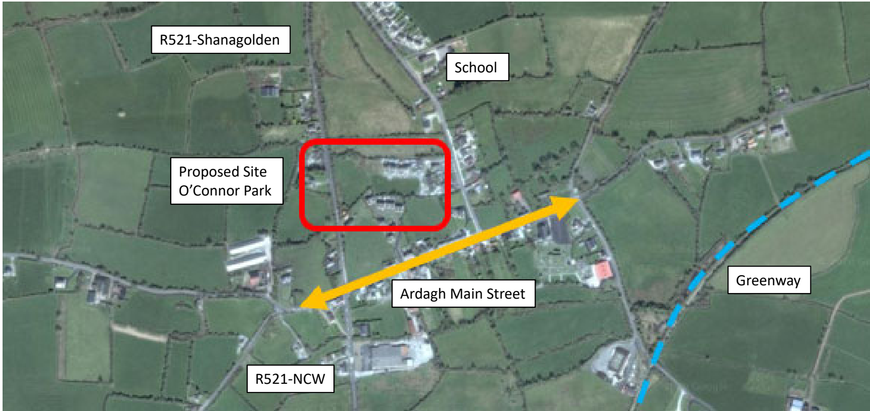
Aerial Image – Location of site to north of Ardagh Main Street