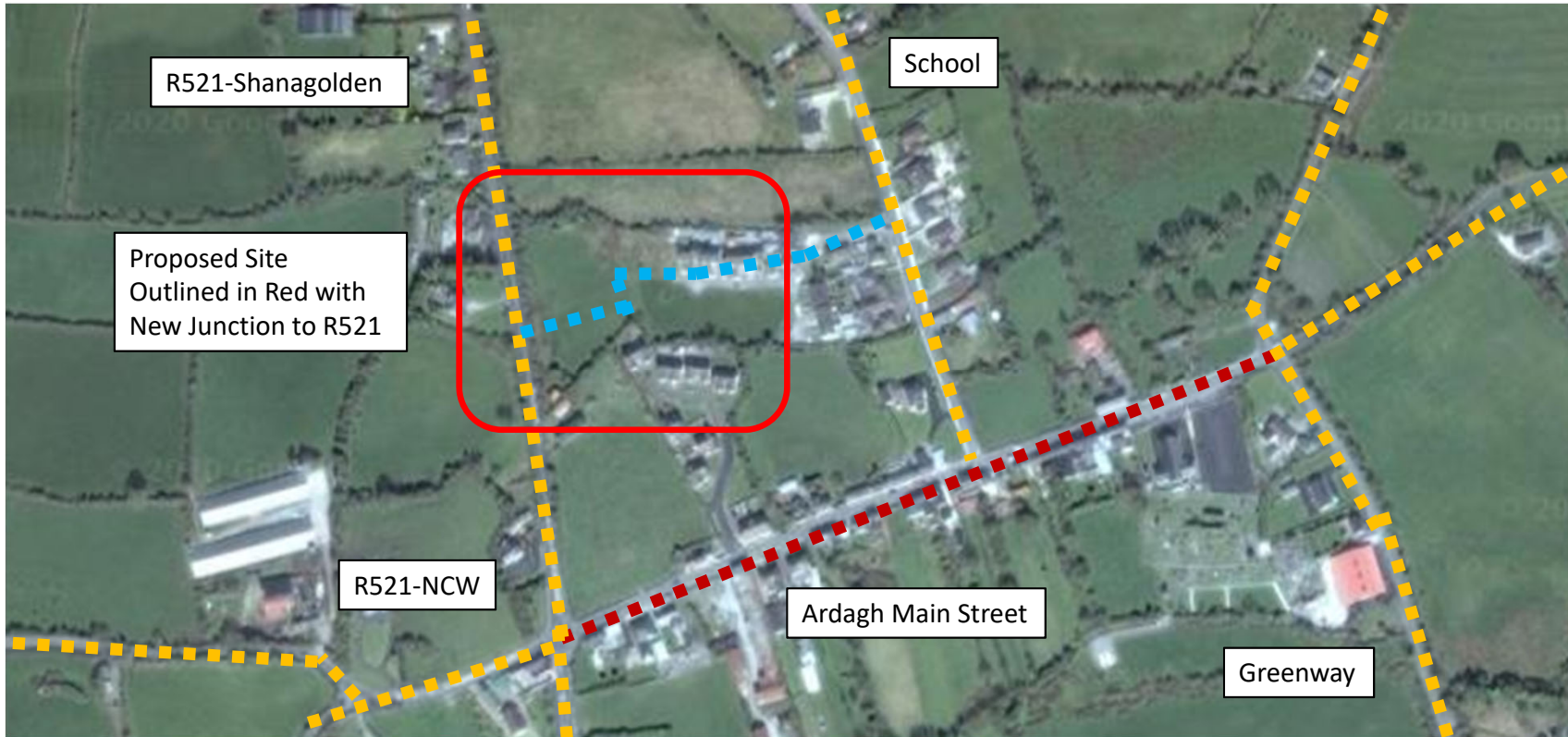
Aerial Image – Location of site to Ardagh Mainstreet