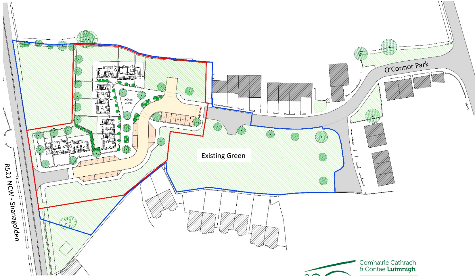
Proposed Siteplan – Rev. A