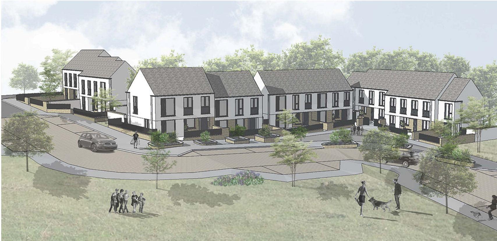
3D Image – Proposed Layout Showing Massing & Scale