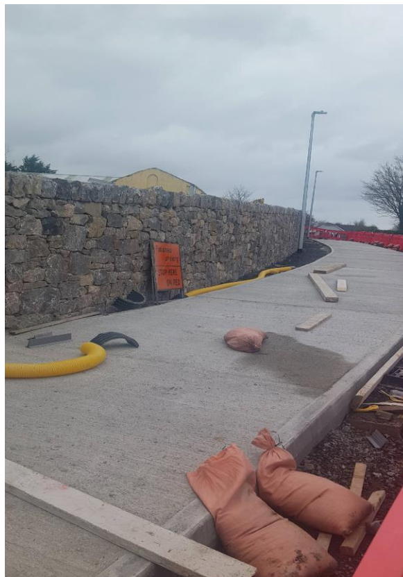
Old Kildimo Junction Improvement Works