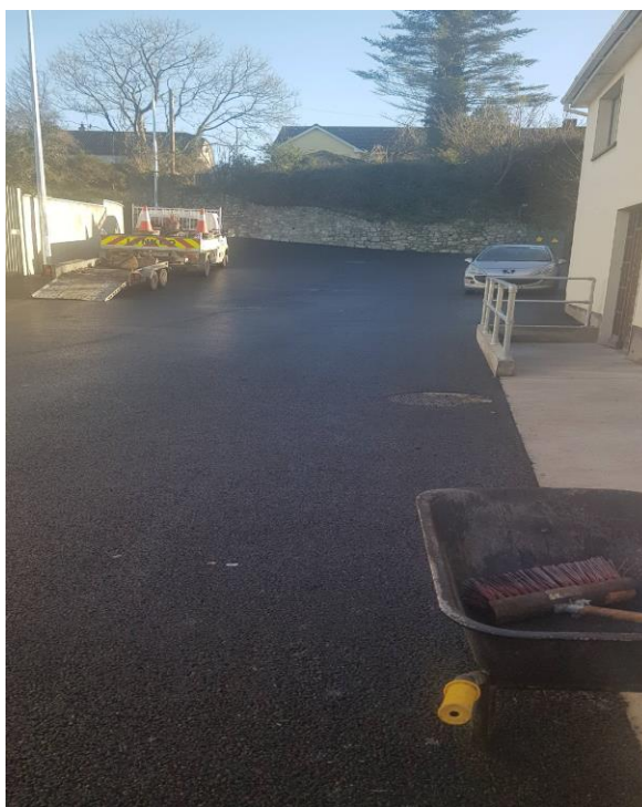
New Car Park Croom