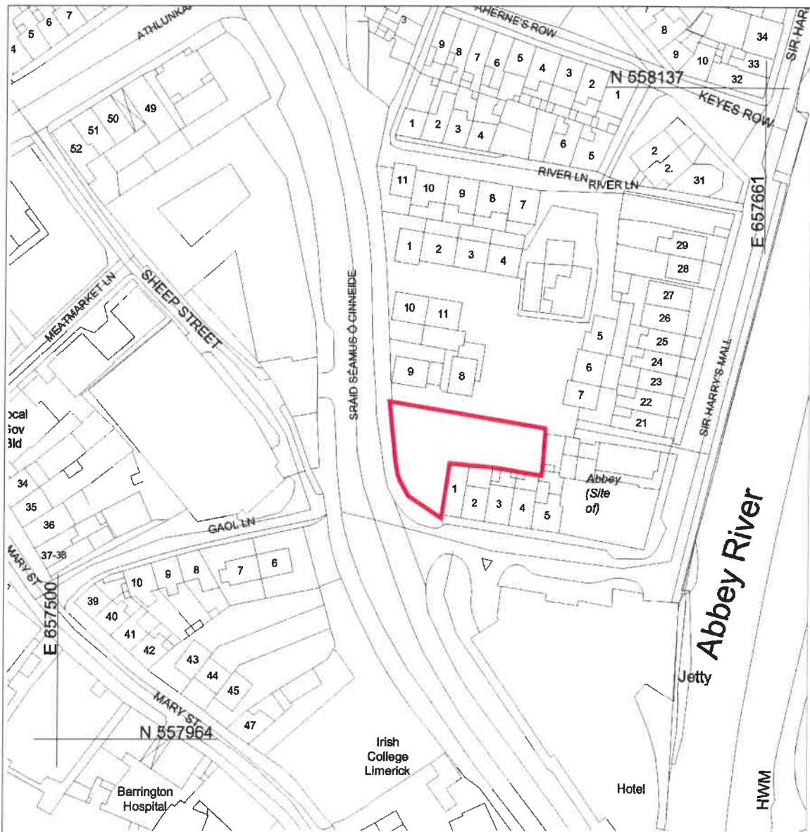
Land for proposed disposal highlighted in Red on the map, outlined area approximately 0.13Acres/0.53 Hectares