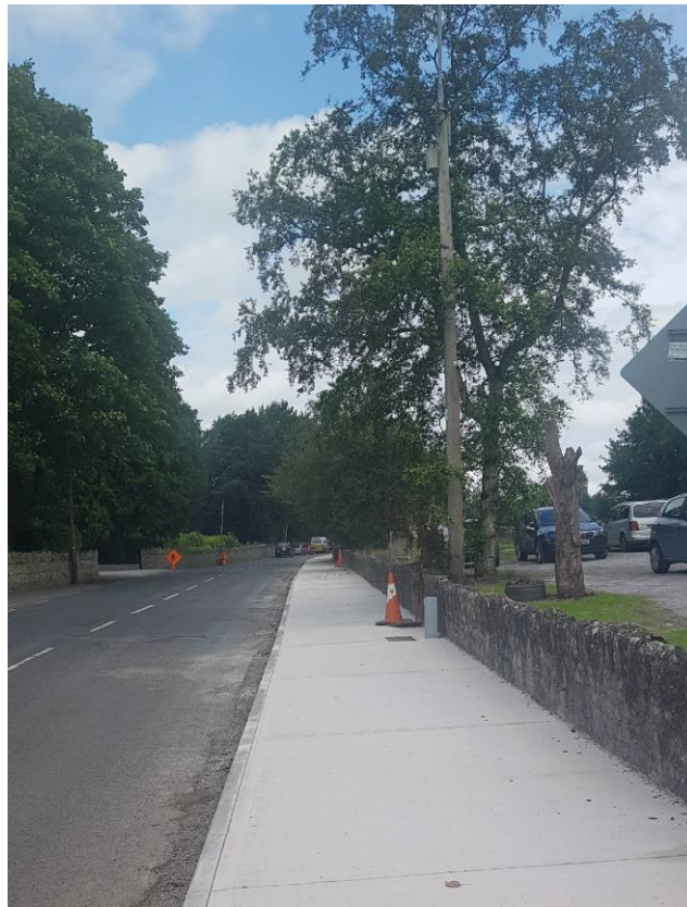
Active Travel Works