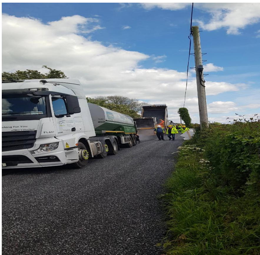
Surface Dressing Fleet