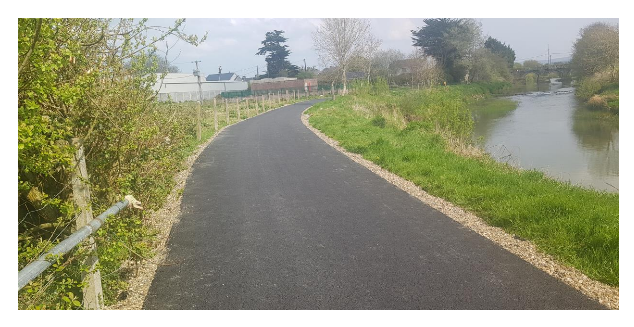
Rathkeale Riverside Walk Works

Works substantially completed on footpath links on the Riverside Walkway and on going from the Library to Whites Garage. Active Travel funds will also be used to complete the Slí na Sláinte route along the Castlematrix Road