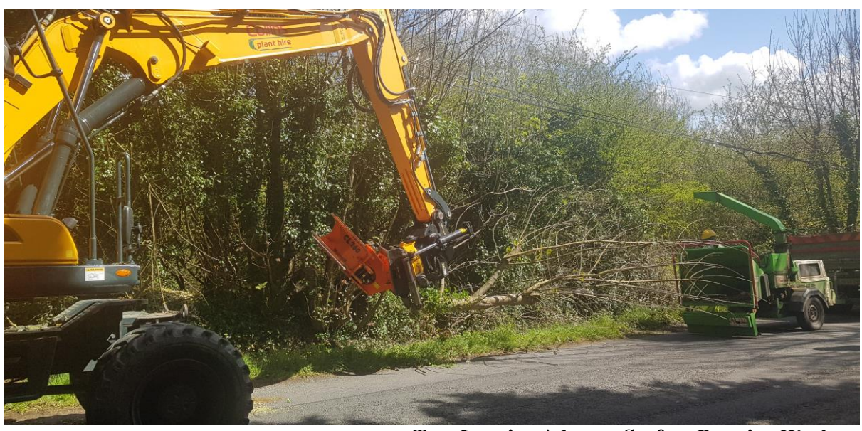
Tree Lopping Advance Surface Dressing Works