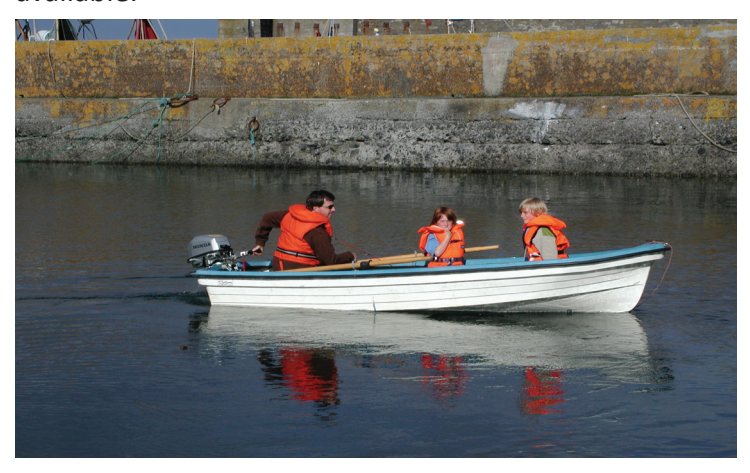
Always wear a Lifejacket on or near water

Bathers should check the EPA's bathing water website, www.beaches.ie, to find out which beaches have safe water quality. The website shares the latest information on over 200 bathing waters sampled by local authorities during the bathing water season, which runs from 1<sup>st</sup> June to 15<sup>th</sup> September. Information on weather, tides and amenities are also available.