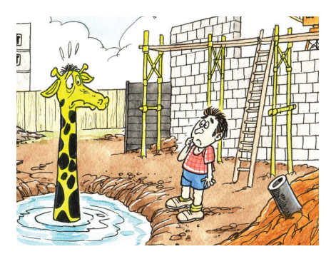
You cannot tell the depth of a hole if it is full of water

Water Safety Information is translated into Irish, Belarusian, Chinese, Czech, Latvian, Lithuanian, Polish, Romanian and Slovakian.