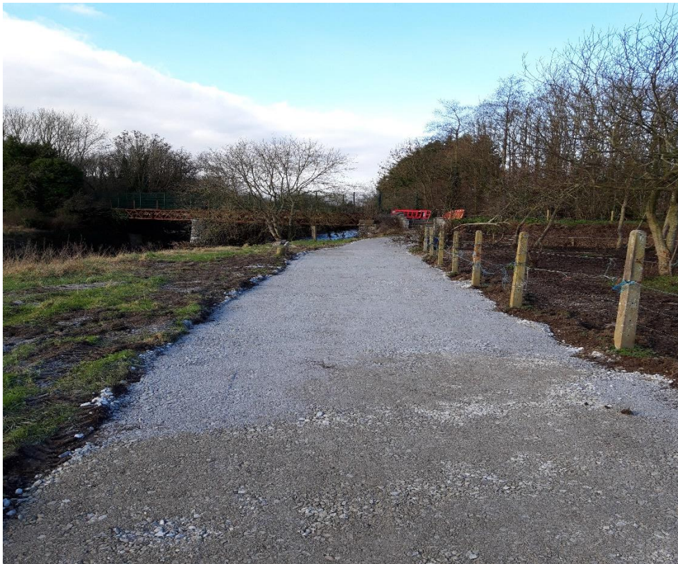
Rathkeale River Walk Works