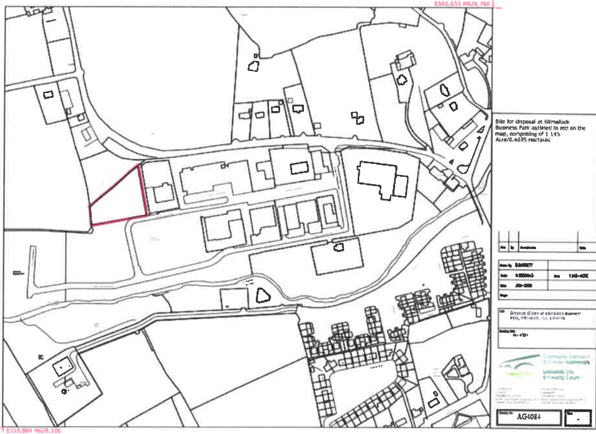
Map AG4084, showing the 1.145 Acre site in red.