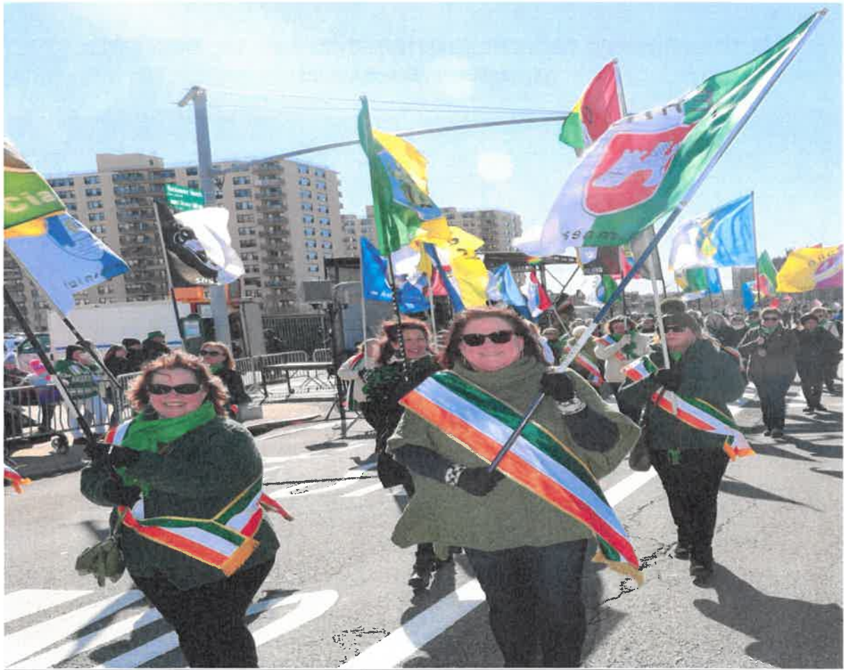
St. Patrick's Day Parade, Rockaway