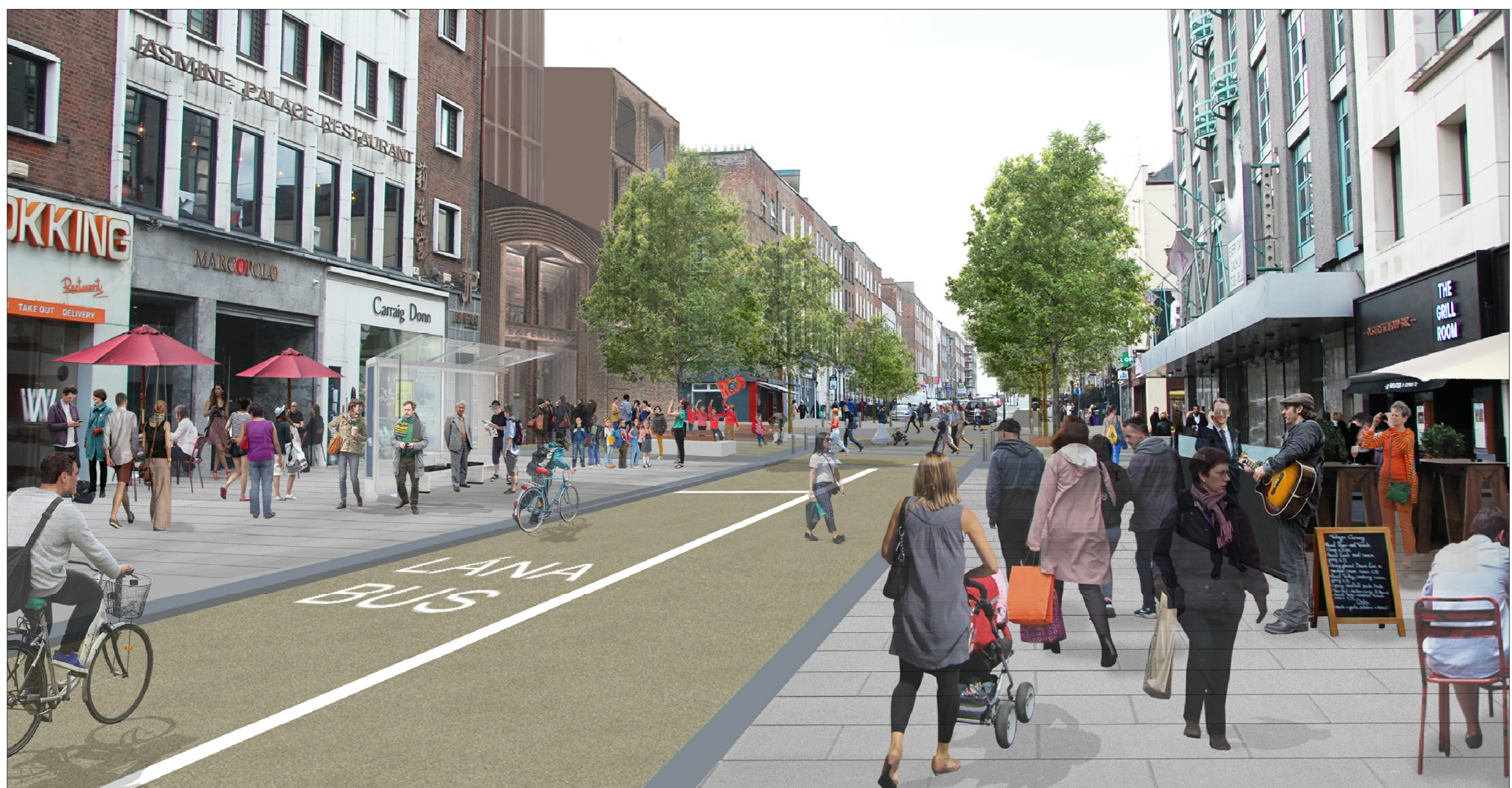
Illustrative view towards International Rugby Experience Museum