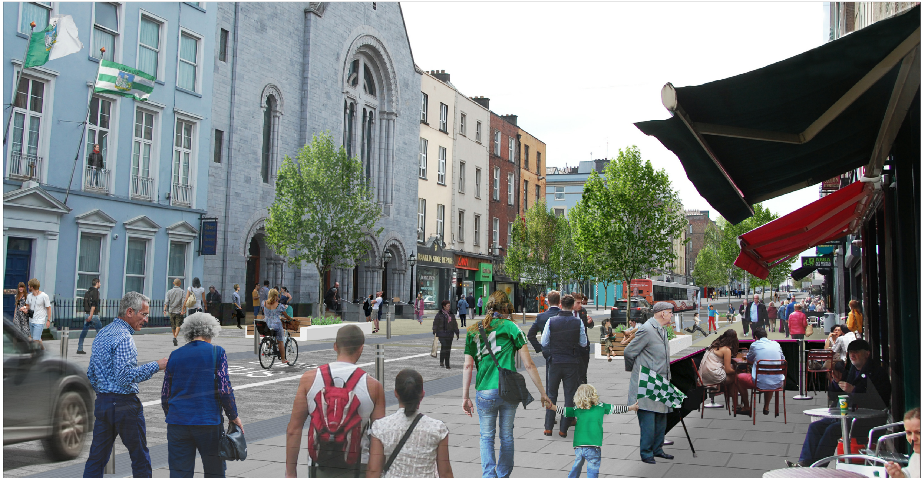
Illustrative view towards St. Augustine's Church