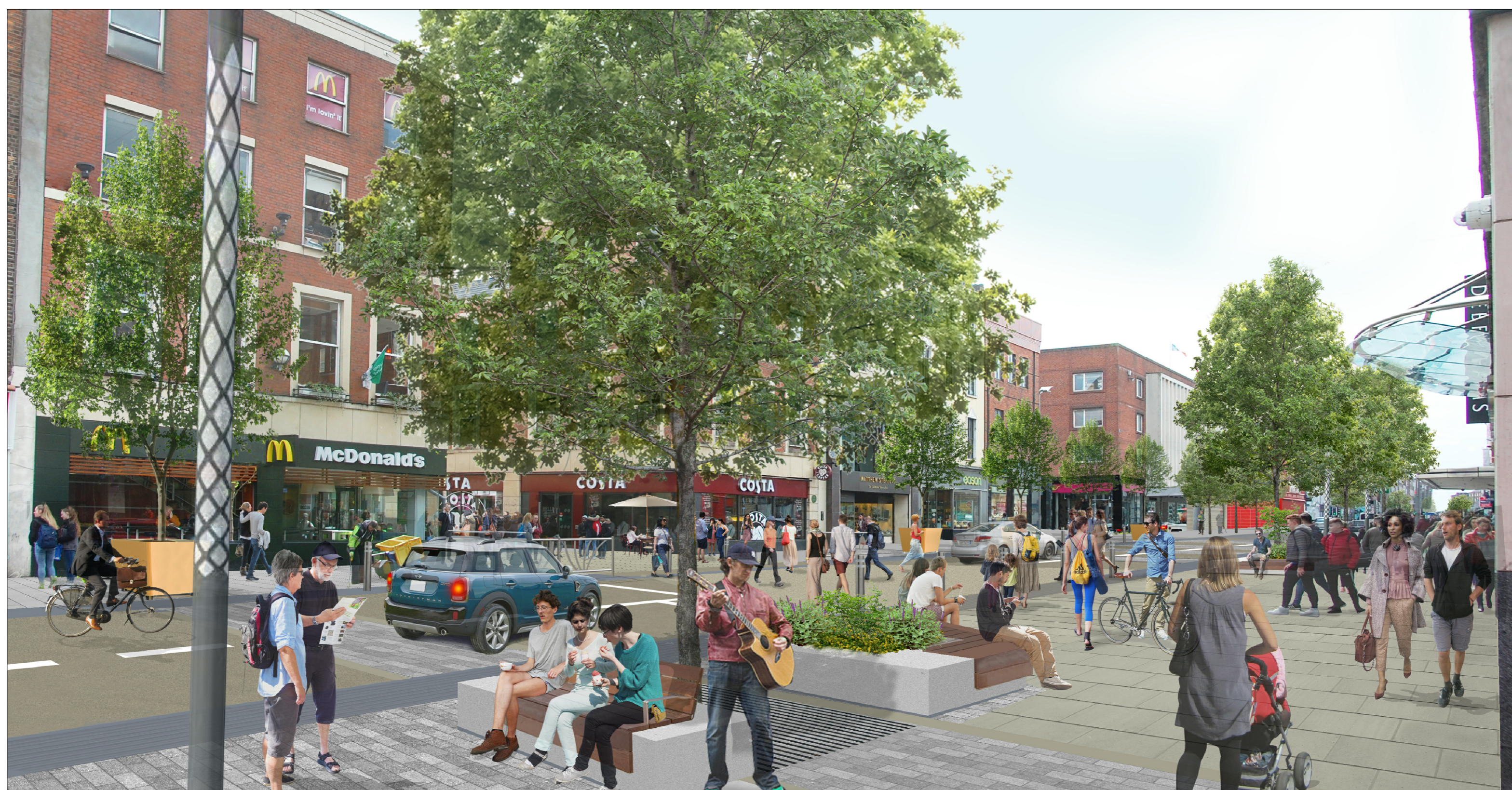
Illustrative view towards Cruises Street