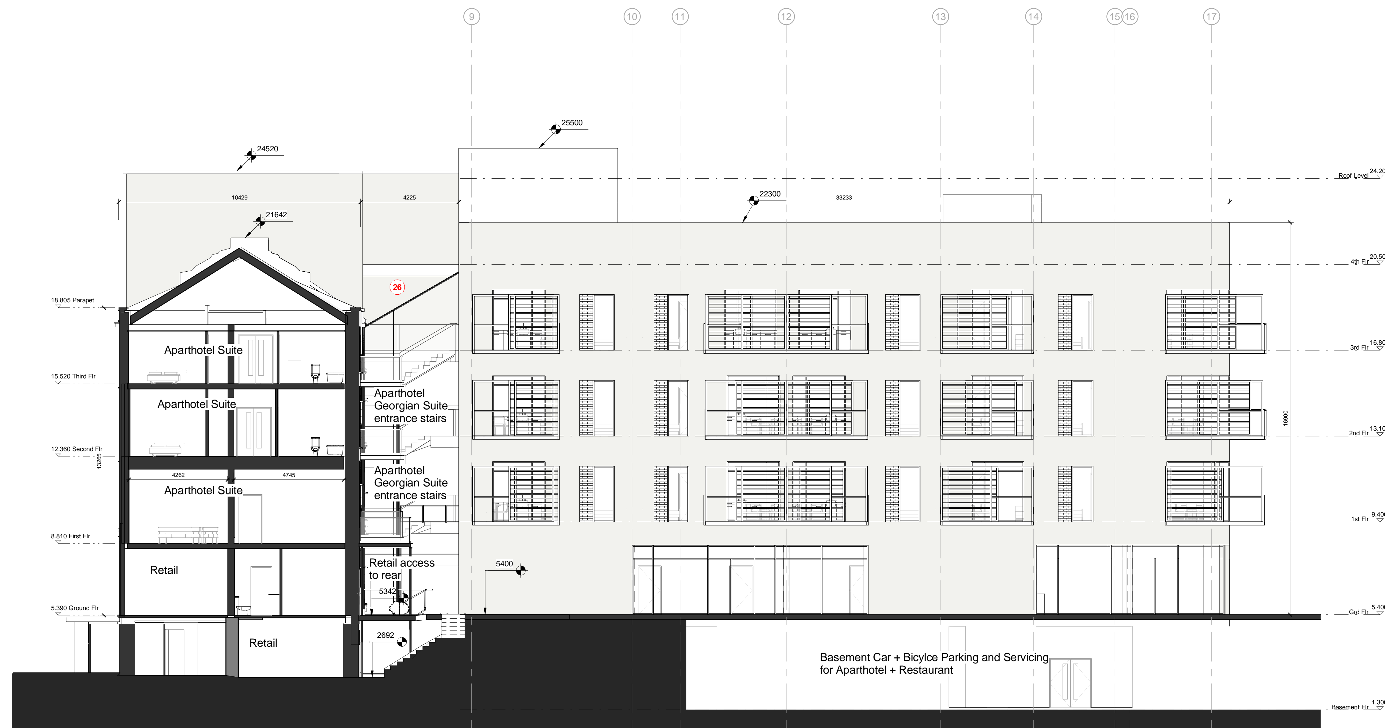
C-C | Section through No 8 Ellen Street - Proposed

(26) Atrium link from Aparthotel to Georgian Suite conversions.