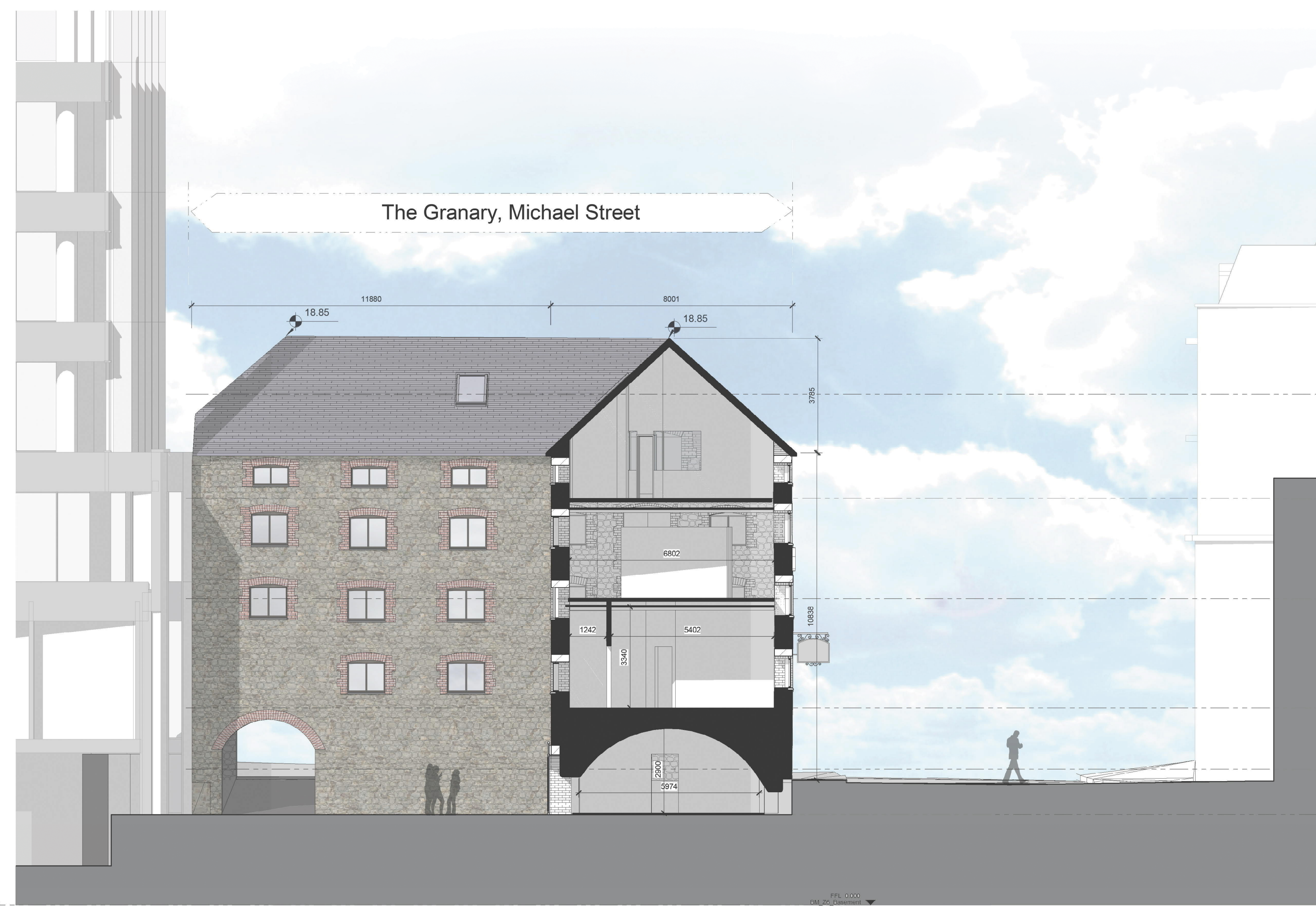
1 Proposed Courtyard Elevation (South 01) SCALE: 1: 100

Re-establish historic brick arches facing onto the internal courtyard at the existing rightlob to the north of the plan, and finish with seamless structural glazing and entrance doors as necessary.