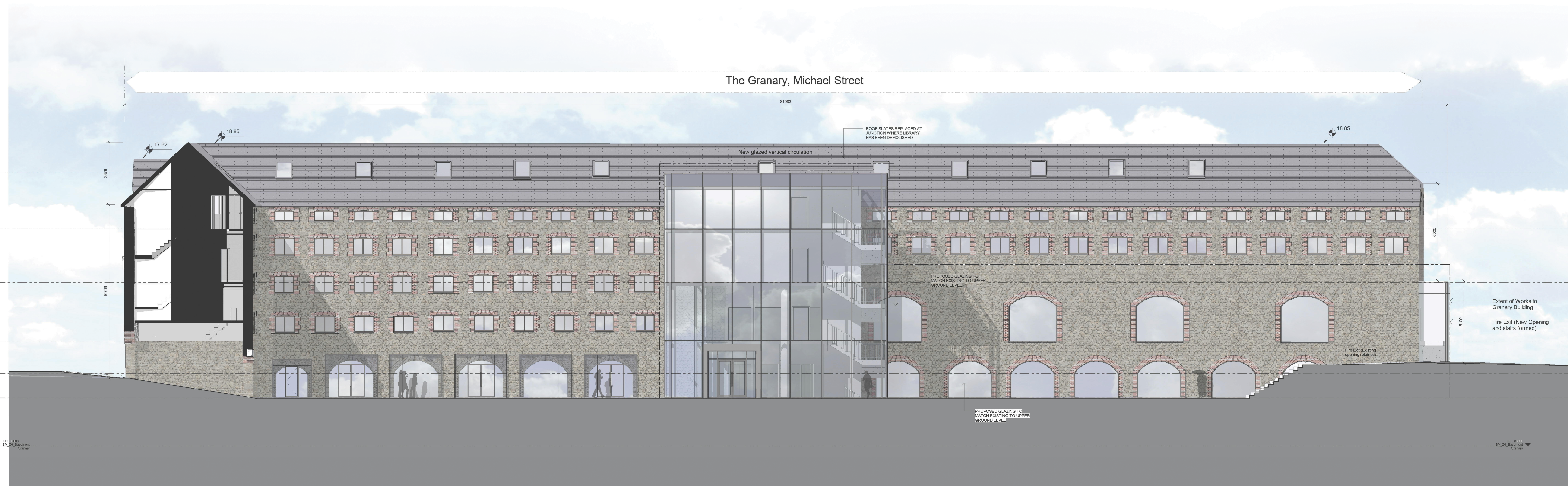
3 Proposed Courtyard Elevation (West) SCALE: 1: 100

Note: All levels referenced to Malin Head Datum