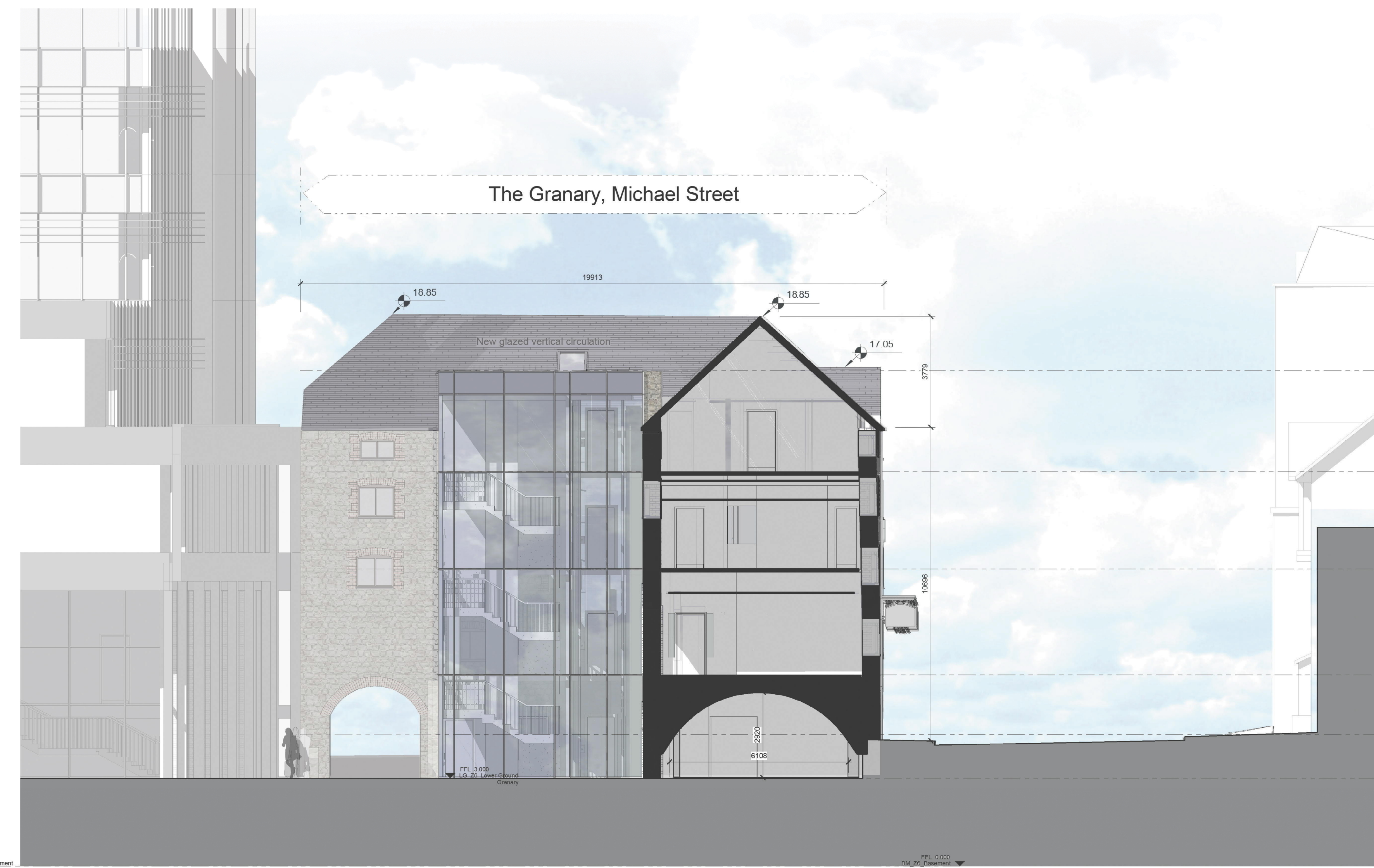
2 Proposed Courtyard Elevation (South 02) SCALE: 1: 100