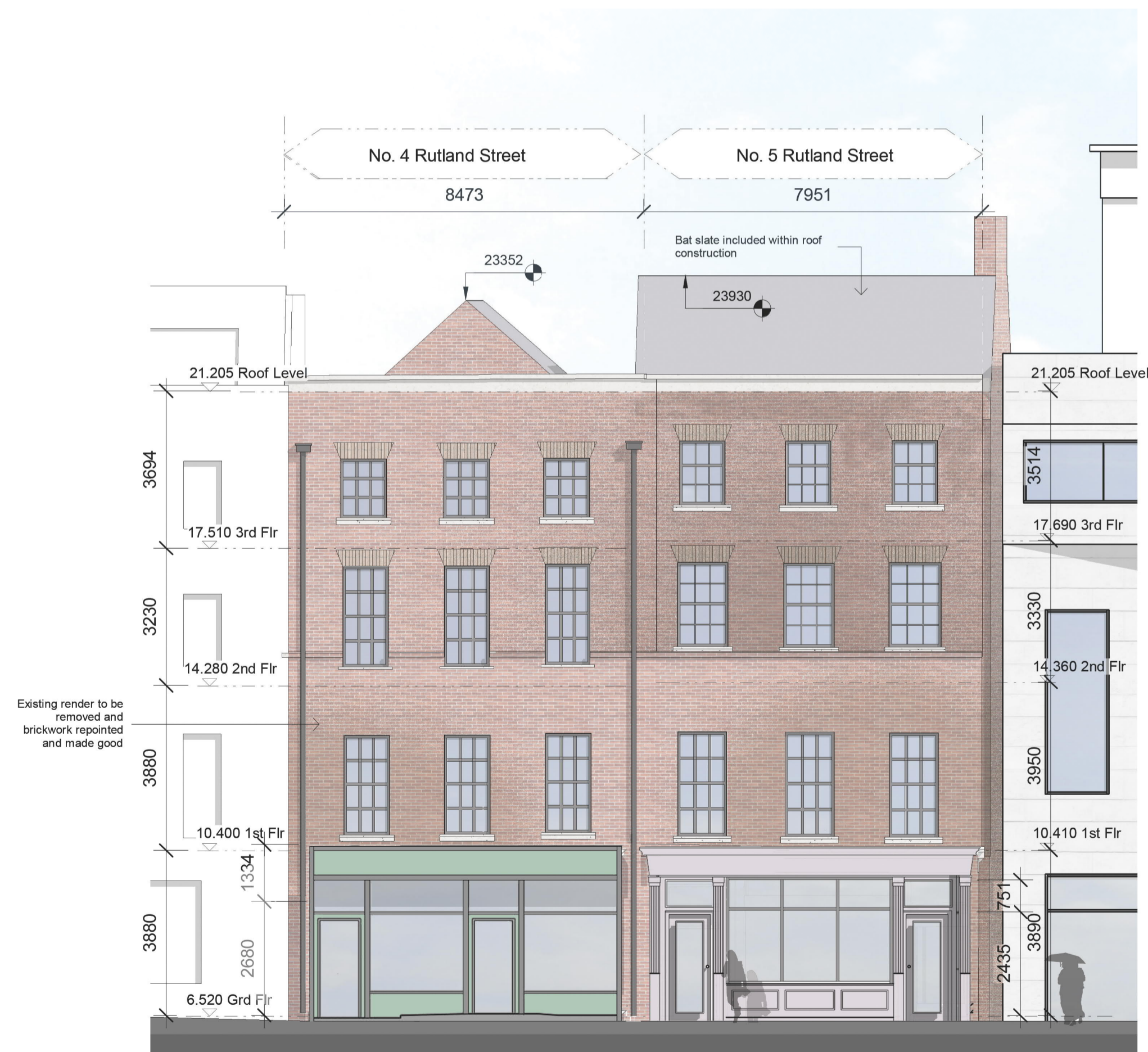
1 | West Elevation - Proposed

An intumescent system is to be used to upgrade raised and fielded panel doors to fire rated doors. Envirograf papers to be used in conjunction with intumescent paints to achieve 30 min fire rating.