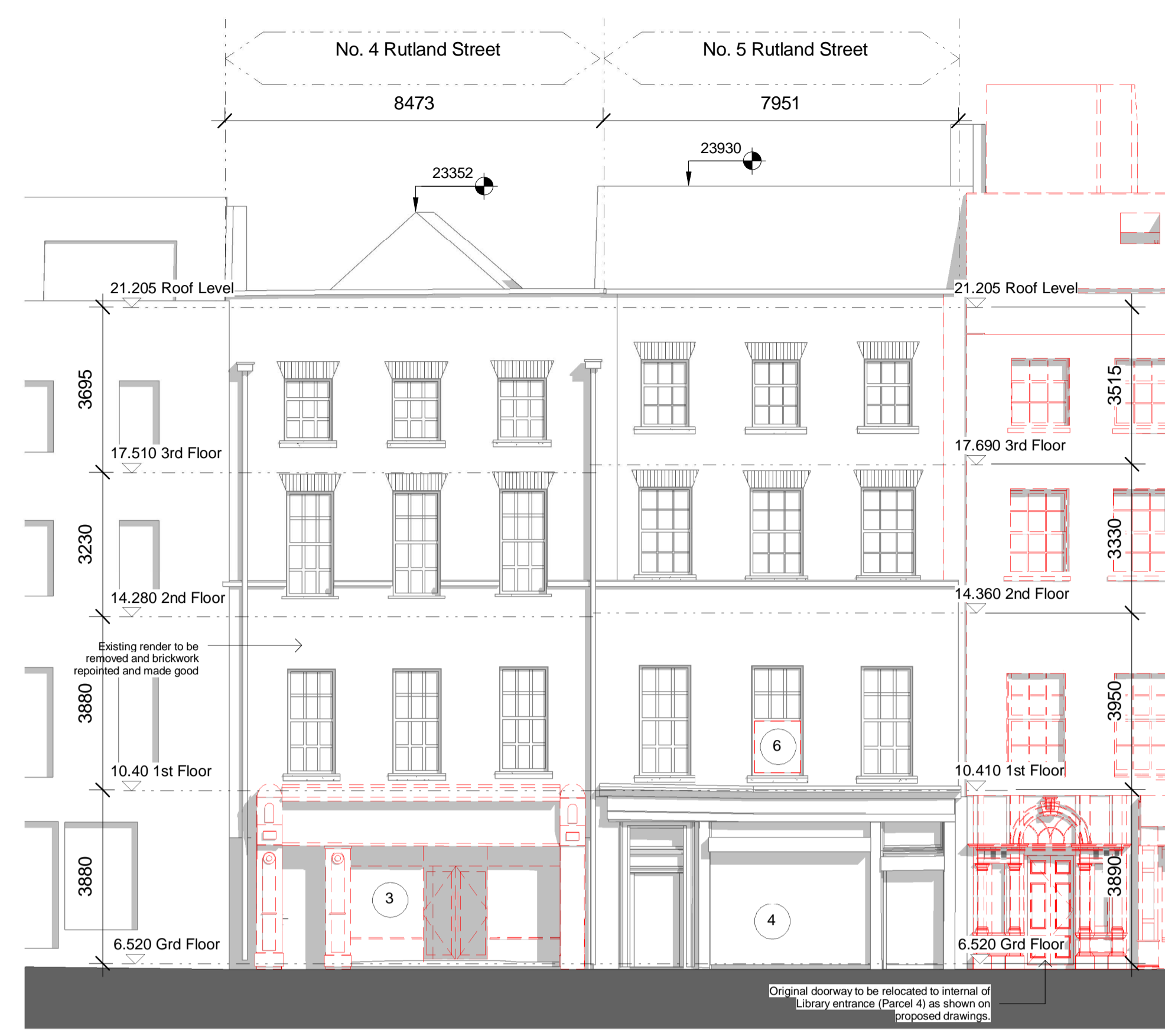
1 Existing West Elevation