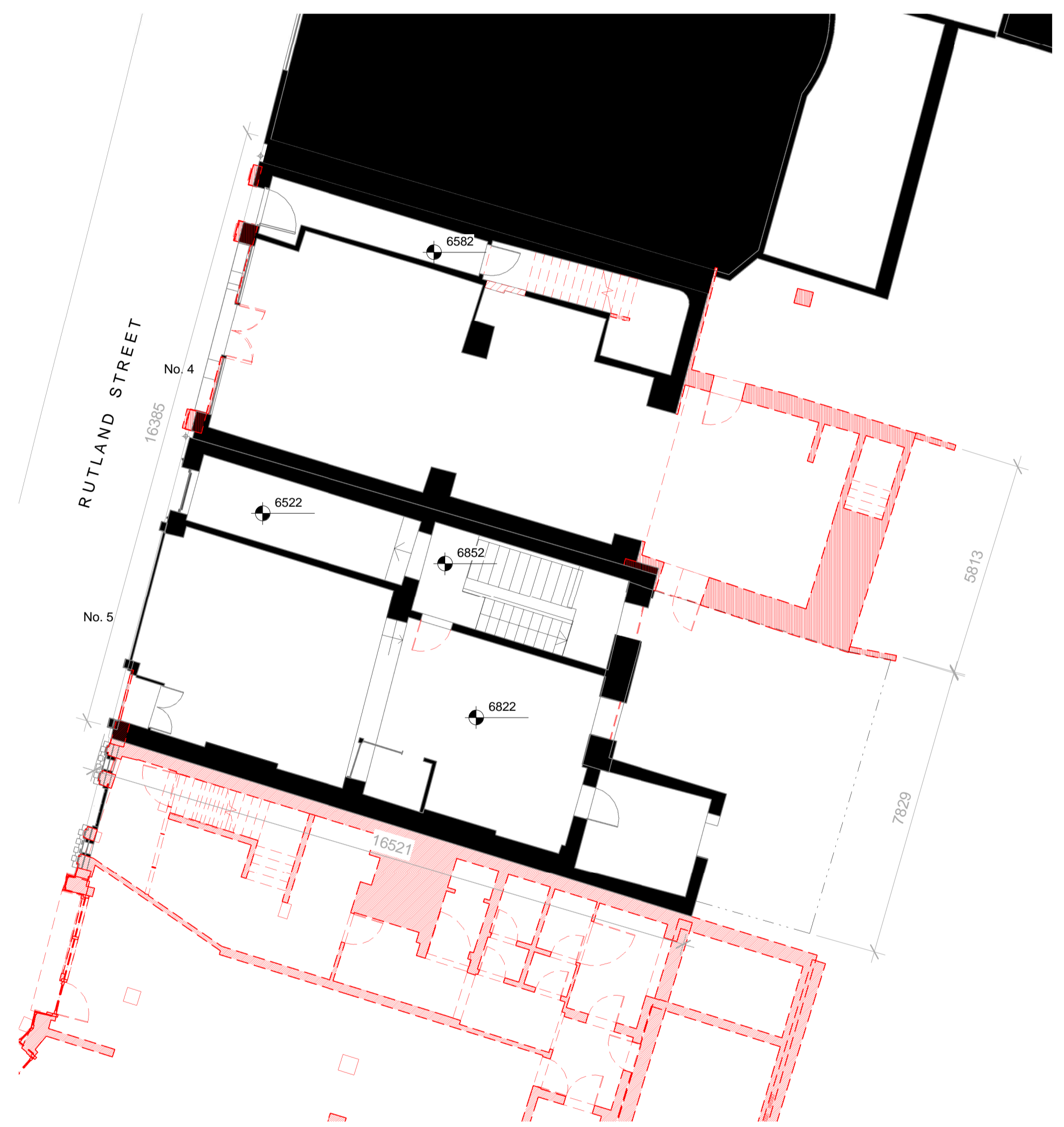
2 Demolition Ground Floor Plan SCALE 1:100