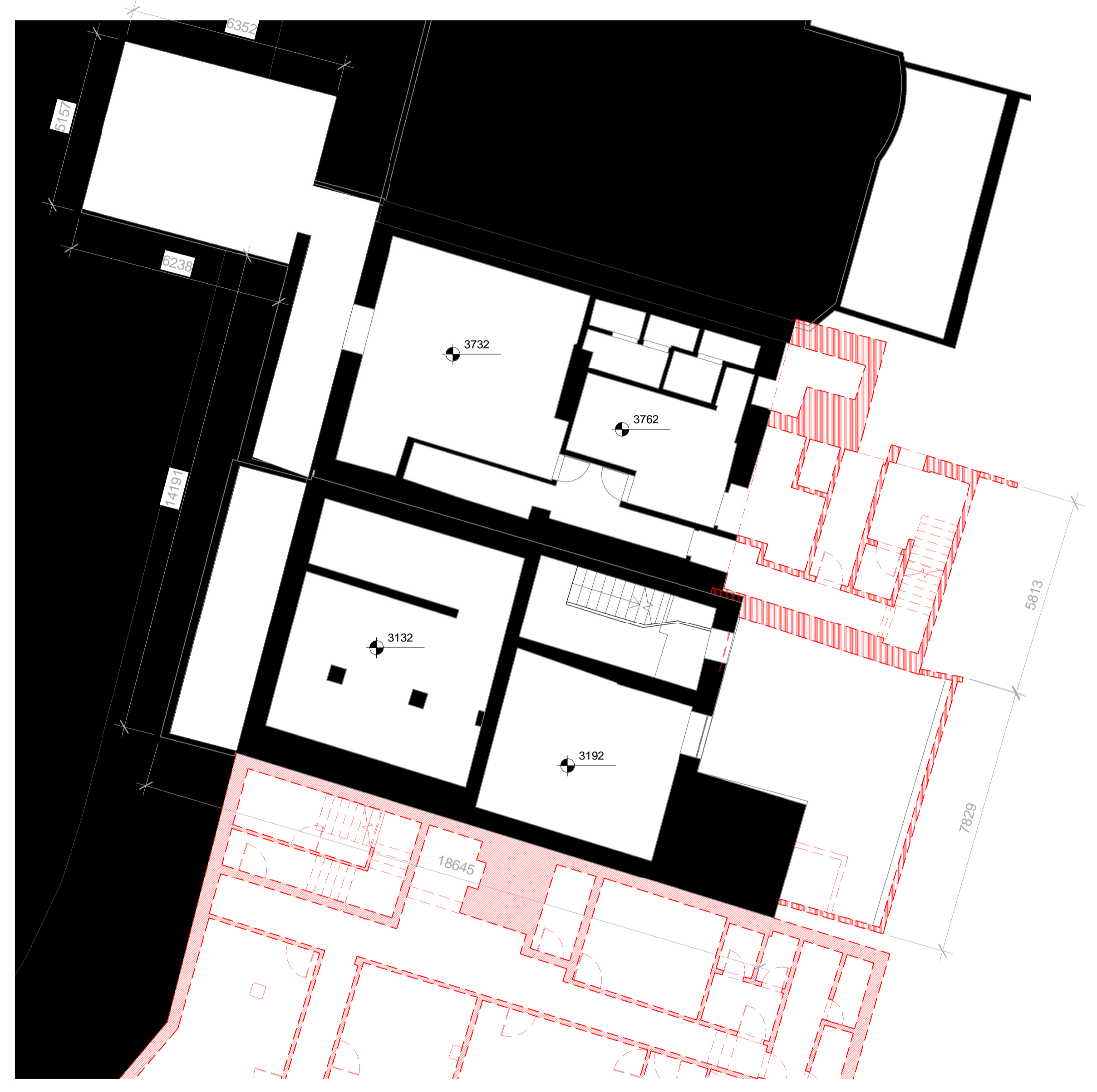
1 Demolition Basement Floor Plan SCALE 1:100

This drawing has been prepared for the use of AECOM's client. It may not be used, modified, reproduced or relied upon by third parties, except as agreed by AECOM or as required by law. AECOM accepts no responsibility, and denies any liability, whatsoever, to any party that uses or relies on this drawing without AECOM's express written consent. Do not scale this document. All measurements must be obtained from the stated dimensions.