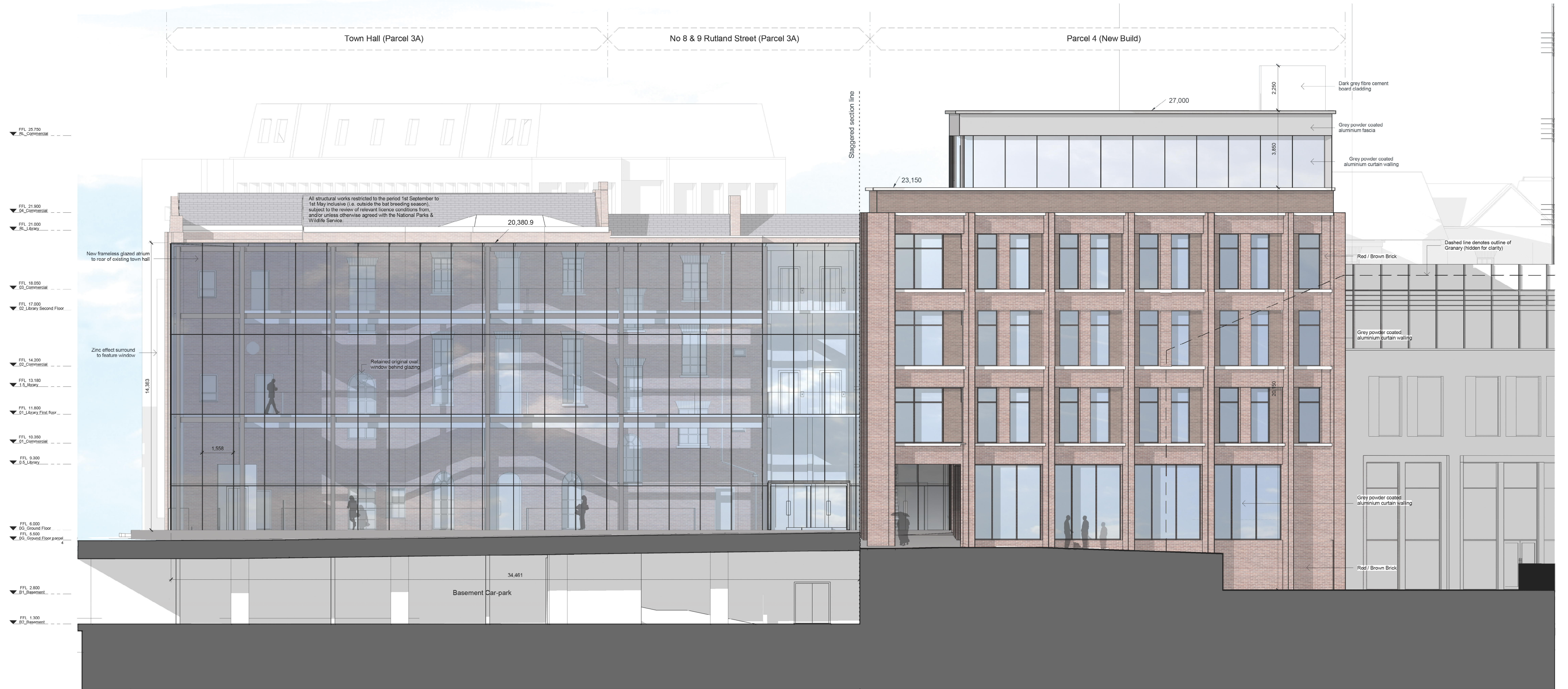
2 Elevation 2 - Townhall Rear SCALE: 1 : 100