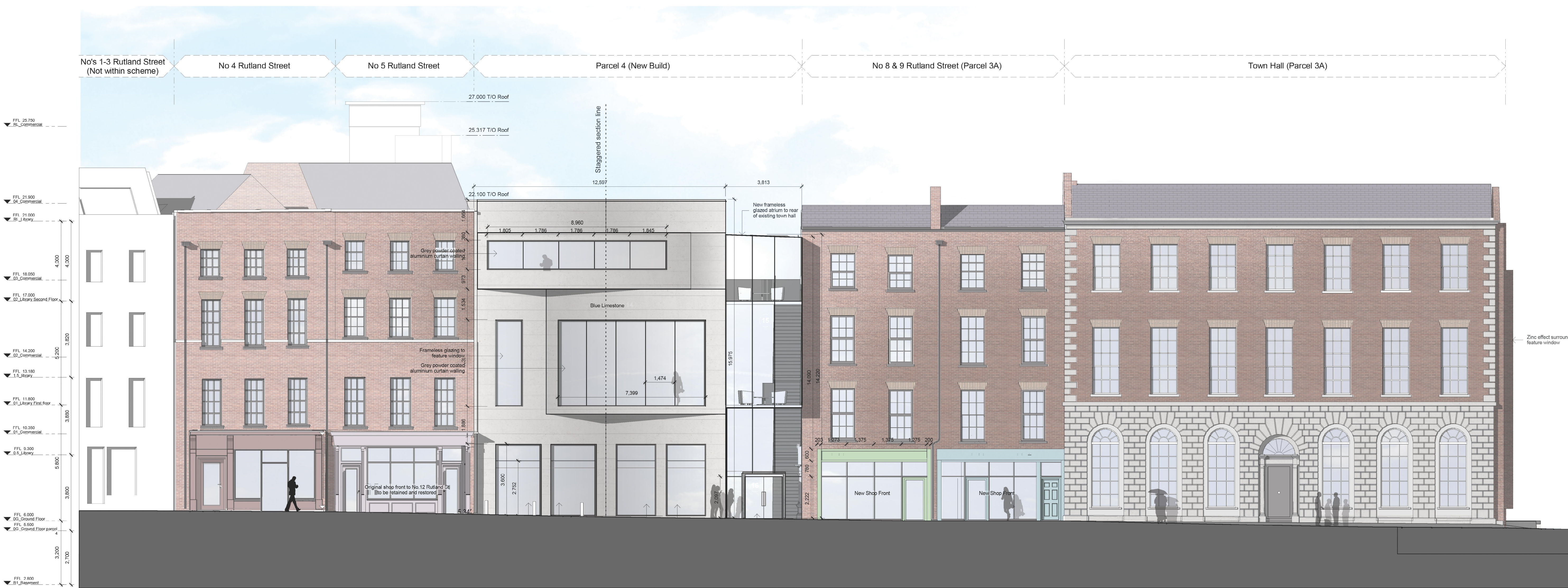
1 Elevation 1 - Townhall Front SCALE: 1 : 100