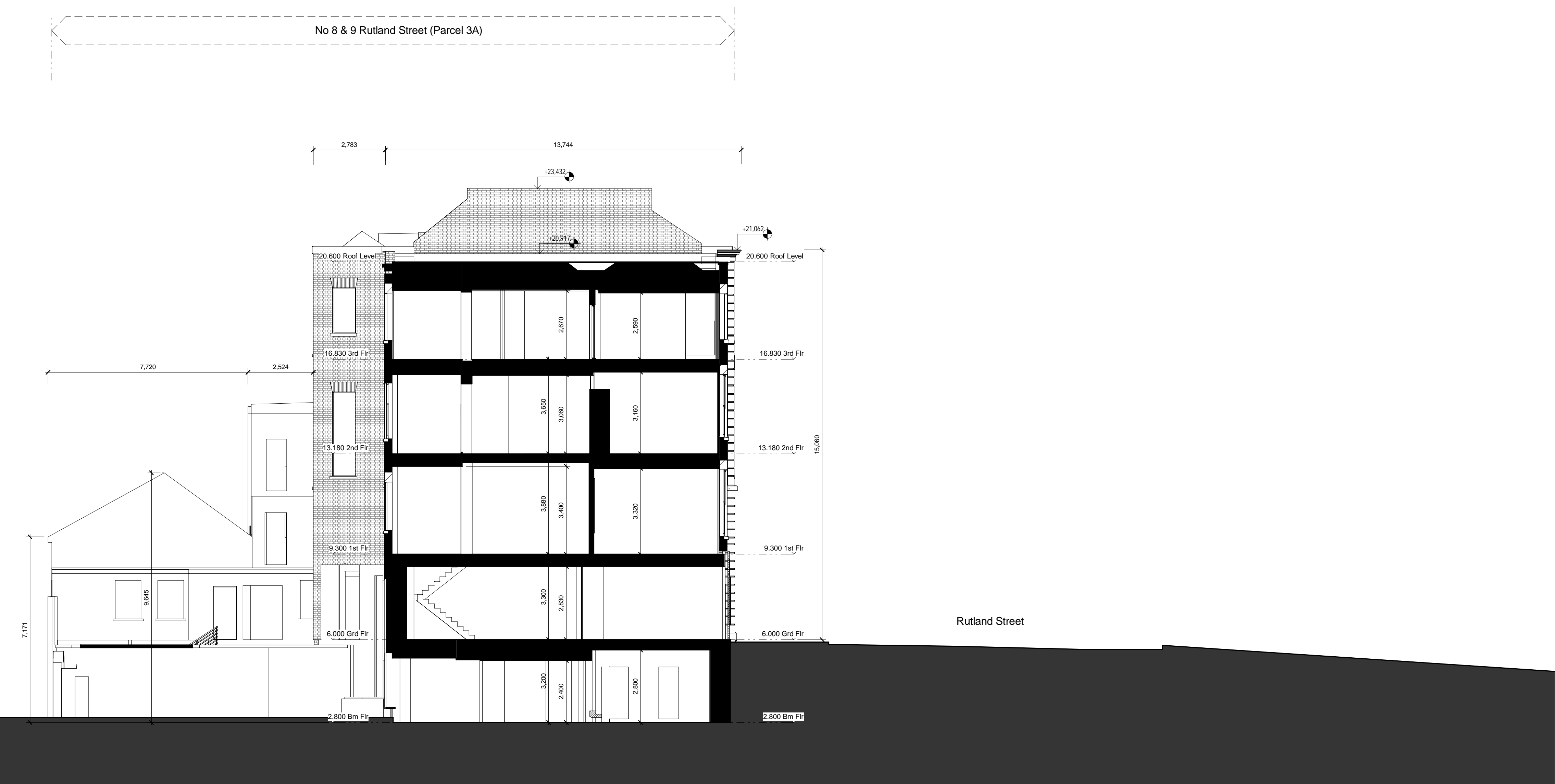
1 Existing Section A-A SCALE: 1 : 100

Project Management Initials - Designer: SP Checked: AW Approved: SP ISO A3 841mm x 1189mm