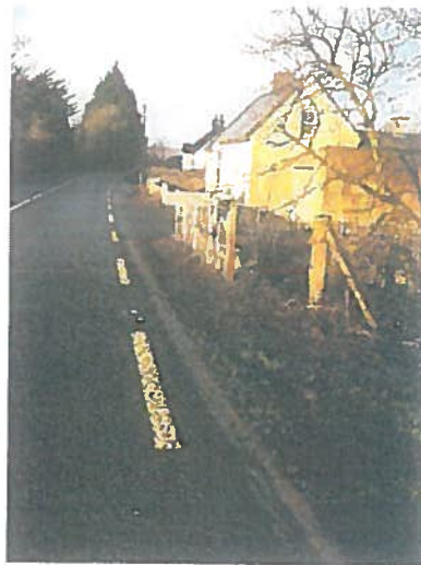
Sections 3 & 4