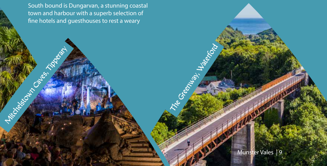
Mitchelstown Caves, Tipperary

You can find our more on www.MunsterVales.com