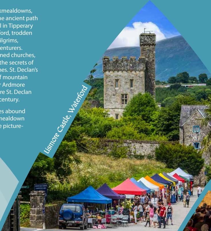
Lismore Castle, Waterford

perfect town of Lismore, on the banks of the Blackwater River, a vibrant heritage town and a favourite of the Vikings who invaded on eight occasions. In the 7th century it was an ancient centre of ecclesiastical learning, comparable to Constantinople and today it features a multitude of intriguing sites including a monastery founded by St. Carhage and the hugely impressive 12th century Lismore Castle, at one point home to Sir Walter Raleigh. Guests who have enjoyed the castle's hospitality include Lucian Freud, Fred Astaire and John. F. Kennedy! In the small town of Cappoquin, seek out the Domana Gate, a Hindu Gothic folly from 1830, enjoy a relaxing day at Cappoquin House and Gardens, or pay a visit to the beautiful Mount Mellary Abbey, home of the Cistercian Monks, nestled in the foothills of the mountains. Drop into the local in Ballyporeen for a quick refreshment, this quaint village is the ancestral home of former US President Ronald Regan who visited in 1984.