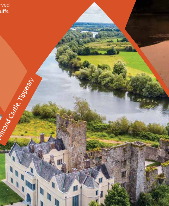
Ormond Castle, Tipperary