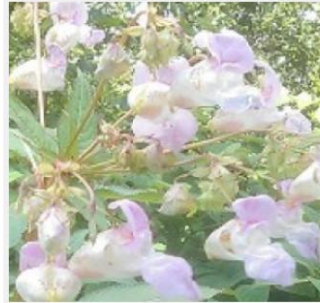
Himalayan Balsam (Imp...