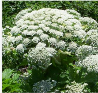
Giant Hogweed (Heracl...