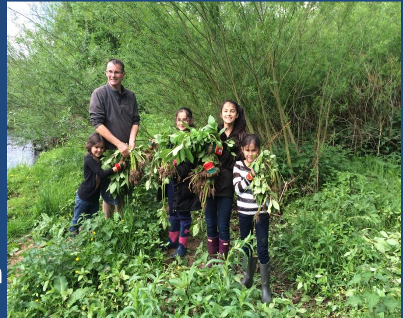
Balsam Bashing in Bollin River Catchment UK