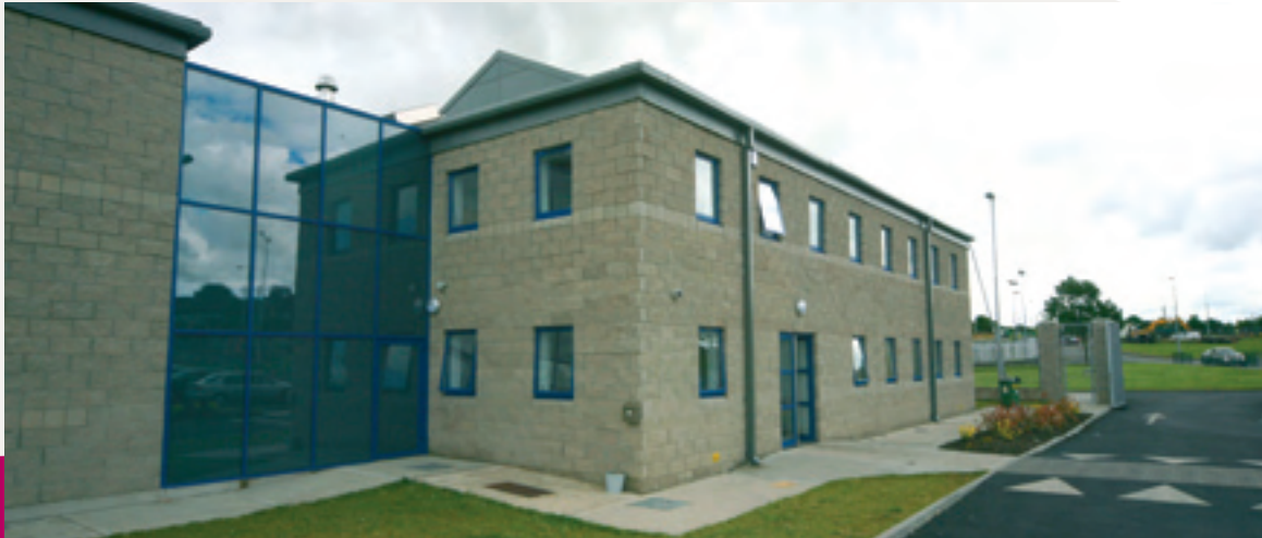
Southill Area Centre opened September 2008