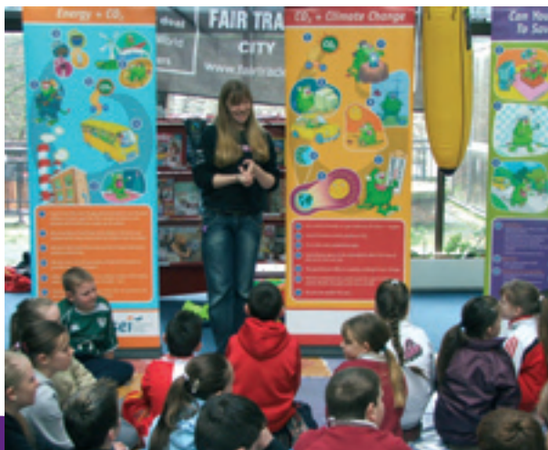
Environmental awareness event for children at Limerick City Library