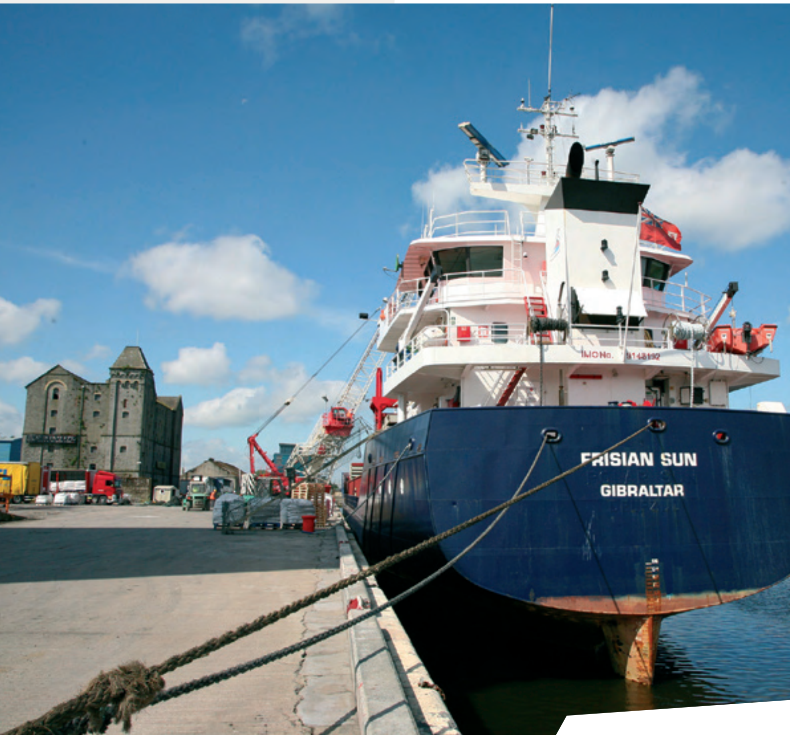
Cargo ship discharging at Limerick Docks