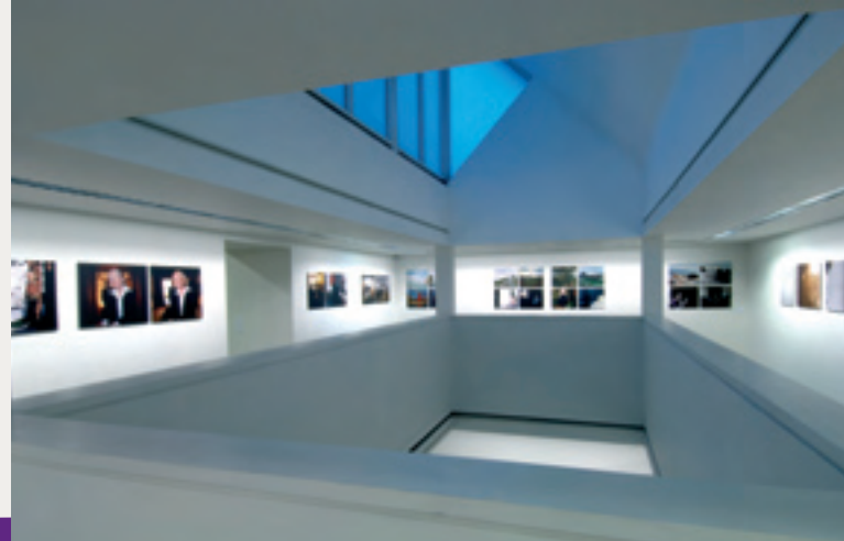
e v+ a Open/Invited at Limerick City Gallery of Art by Ailbhe Greaney