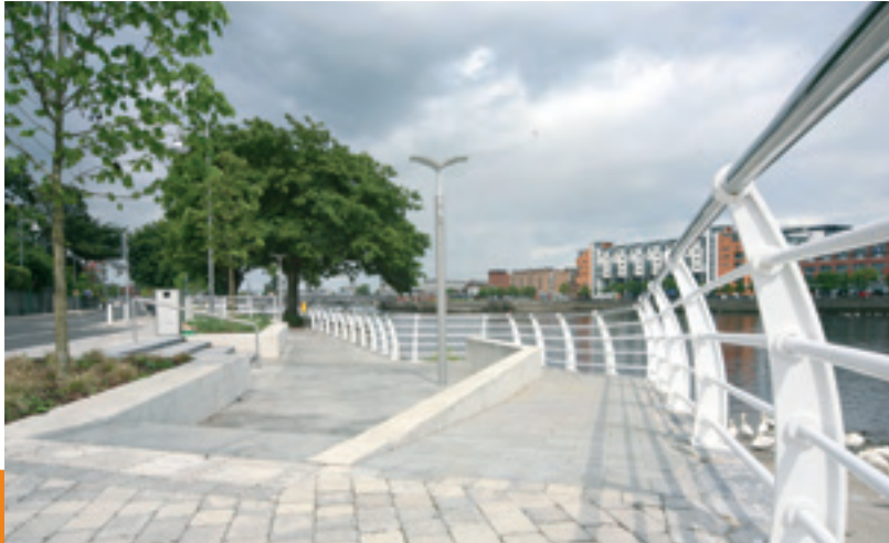
Riverside improvement scheme