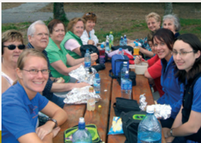
Limerick City Community Safety Partnership - Walking Club

Priority areas for 2008 included the following actions: