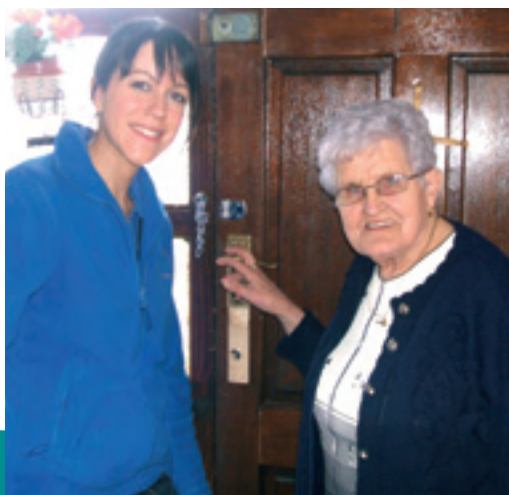
Limerick City Community Safety Partnership - home safety chain initiative