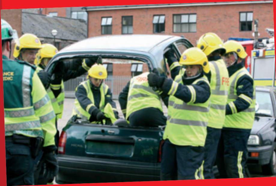
Above: New Fire Fighters simulating a rescue from a Road Traffic Accident.