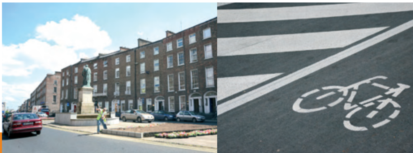
The Crescent, O'Connell Street