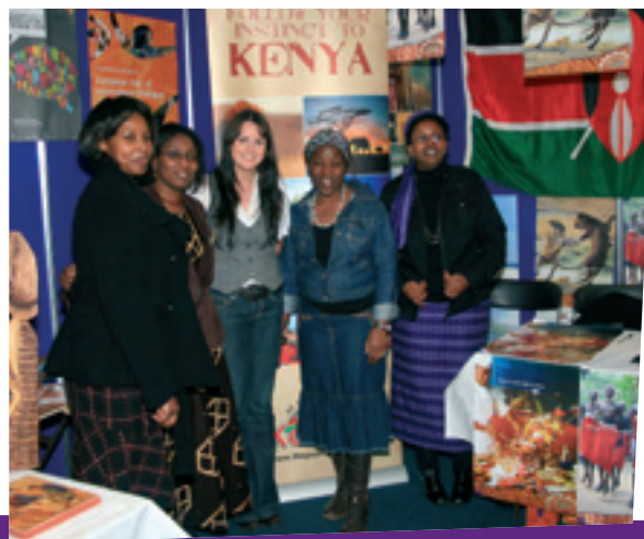
Culture Day at Limerick City Hall