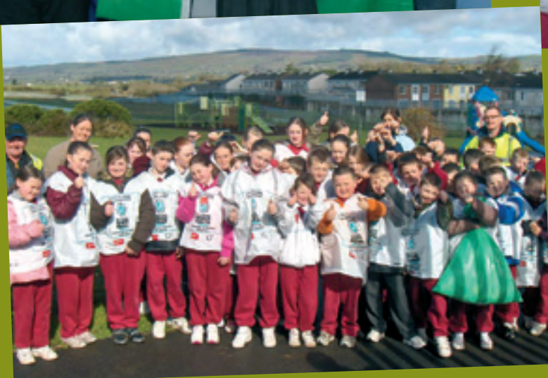
Left Corpus Christi School