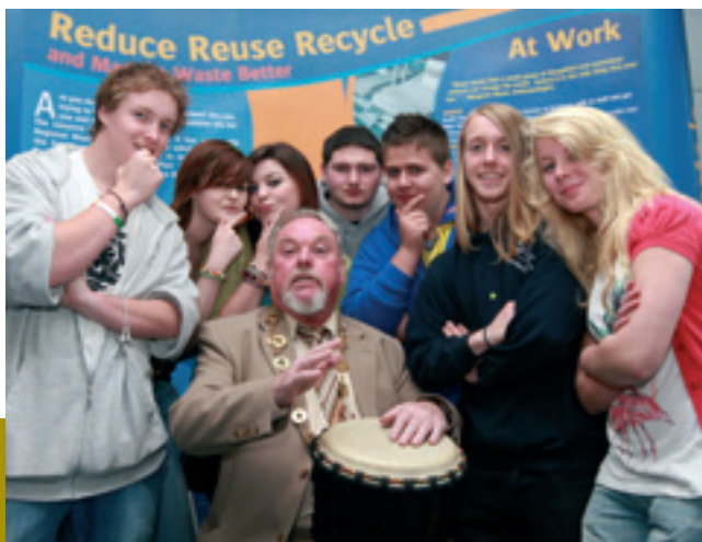
Limerick Youth Conference