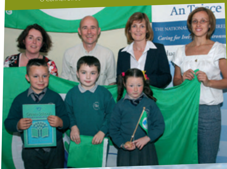
Left St. Michael's Infant School