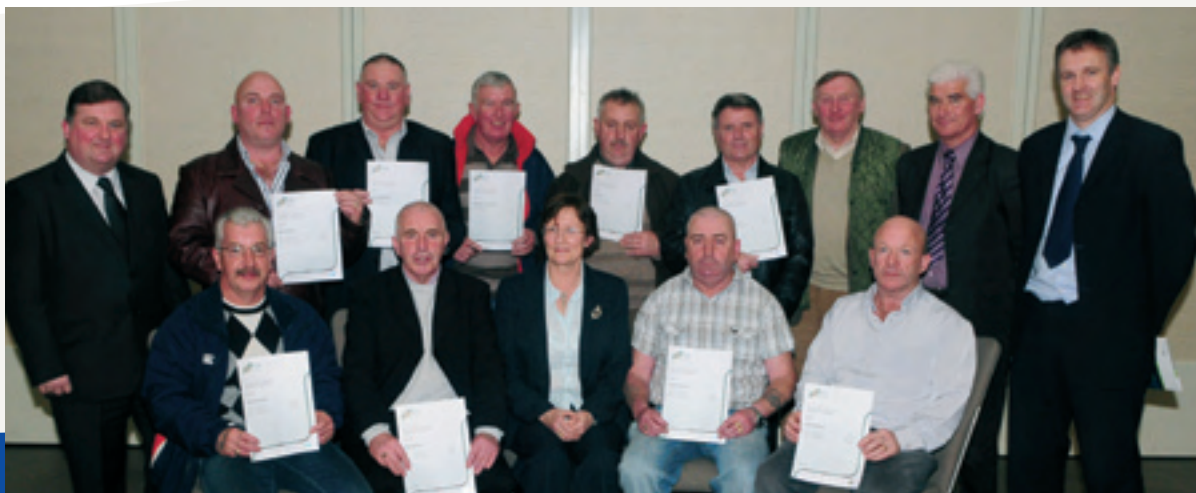
Return to Learning Programme 2007/2008