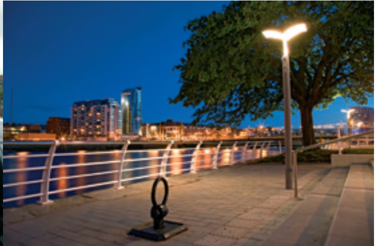
O'Callaghan Strand riverside improvement development