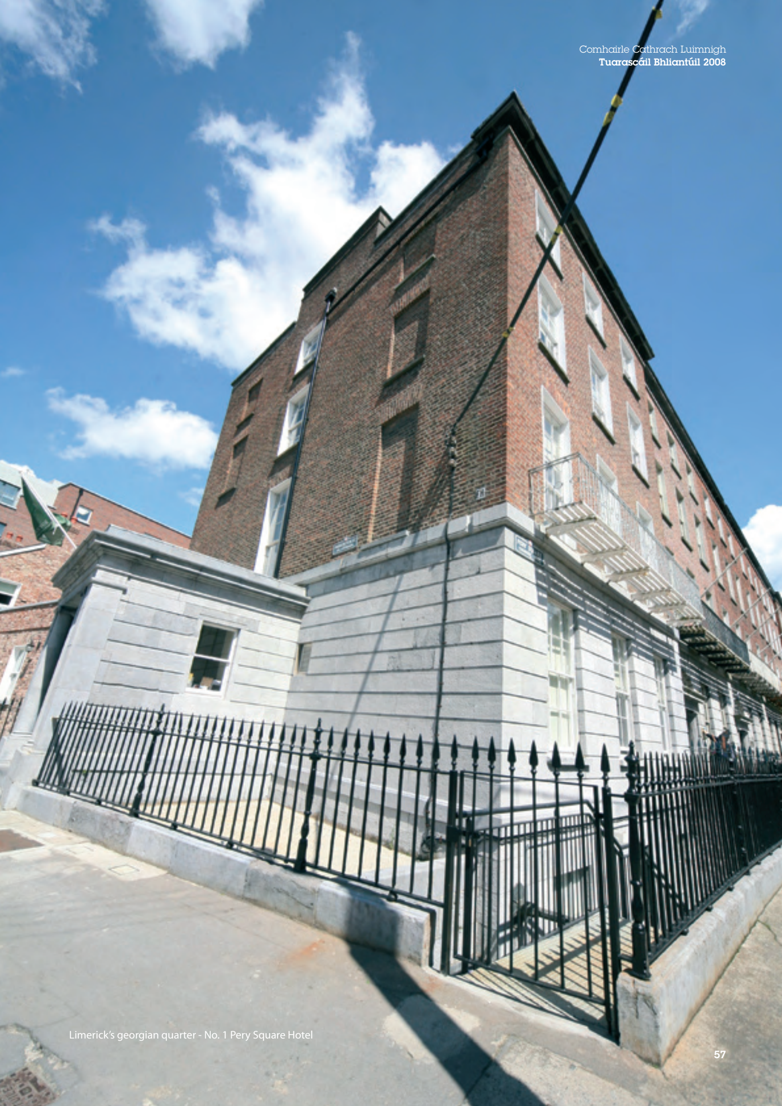
Limerick's georgian quarter - No. 1 Pery Square Hotel