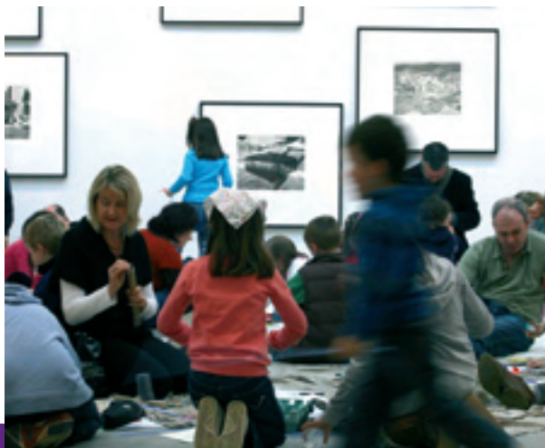
Visual Poetry Day at Limerick City Gallery of Art