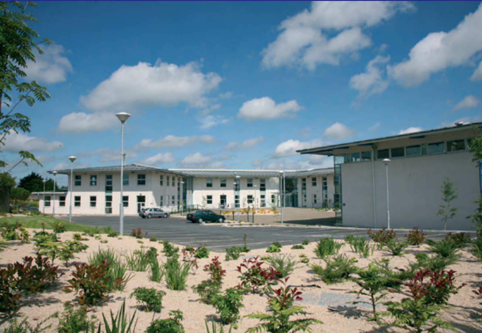
St. Clements College, South Circular Road new school building